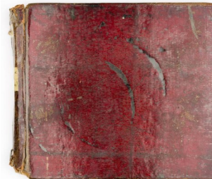
Cover of Minton's Pattern Book Number 1

examples of content are provided for each of these categories, including images like those of the first pattern book