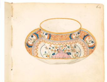
Hand painted example of pattern number 64 in Minton's Pattern Book Number 1

The team also maintains a blog to which information about site updates is regularly published.