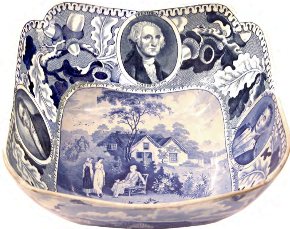
02: Cut-corner bowl, 4 medallions, a and b vignettes, R Stevenson and Williams, Arman 417.