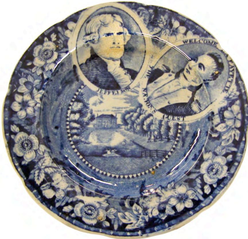
04: Plate, 2 medallions, no vignettes, Arman 429.