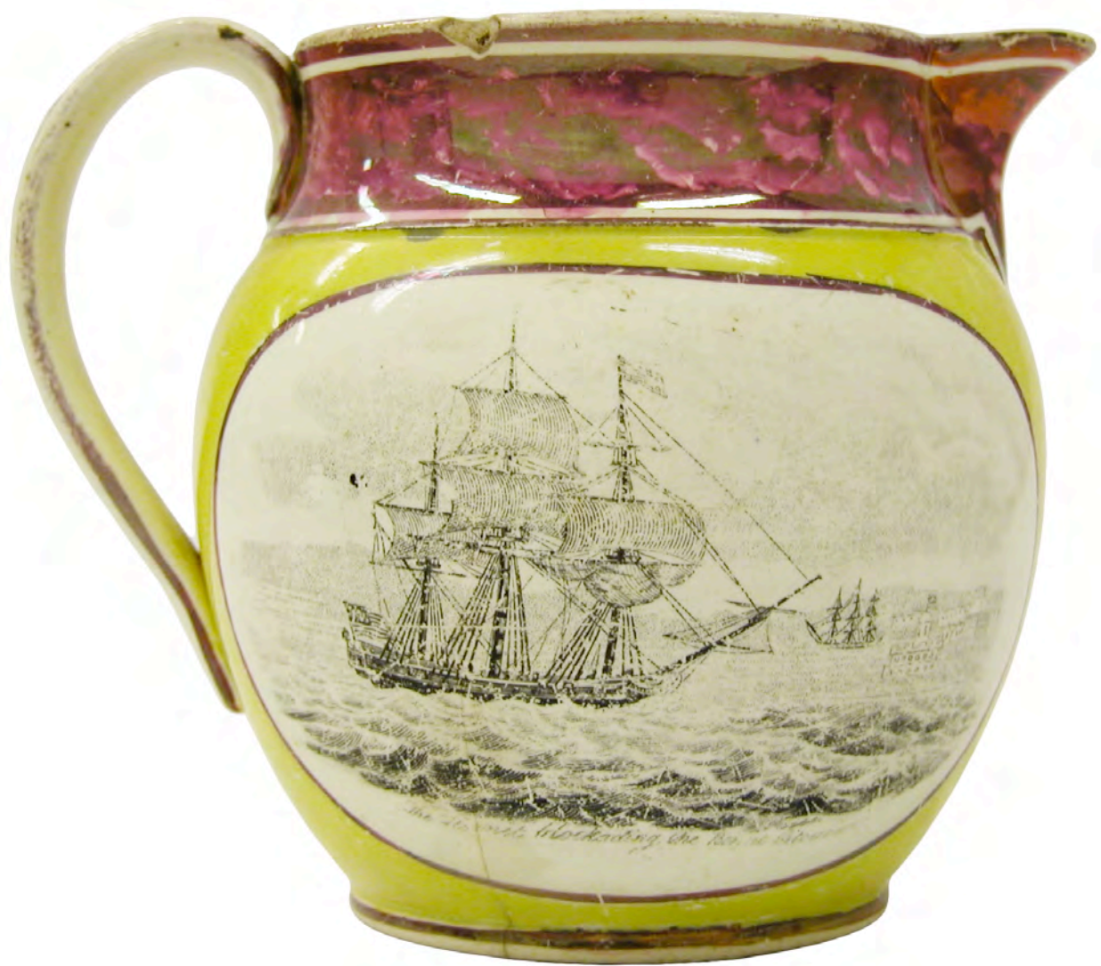
41: Pitcher, "Hornet Blockading the Bon Citoyenne", E. Wood & Sons, Arman "Anglo-American Ceramics Vol. I", p 107, H15.