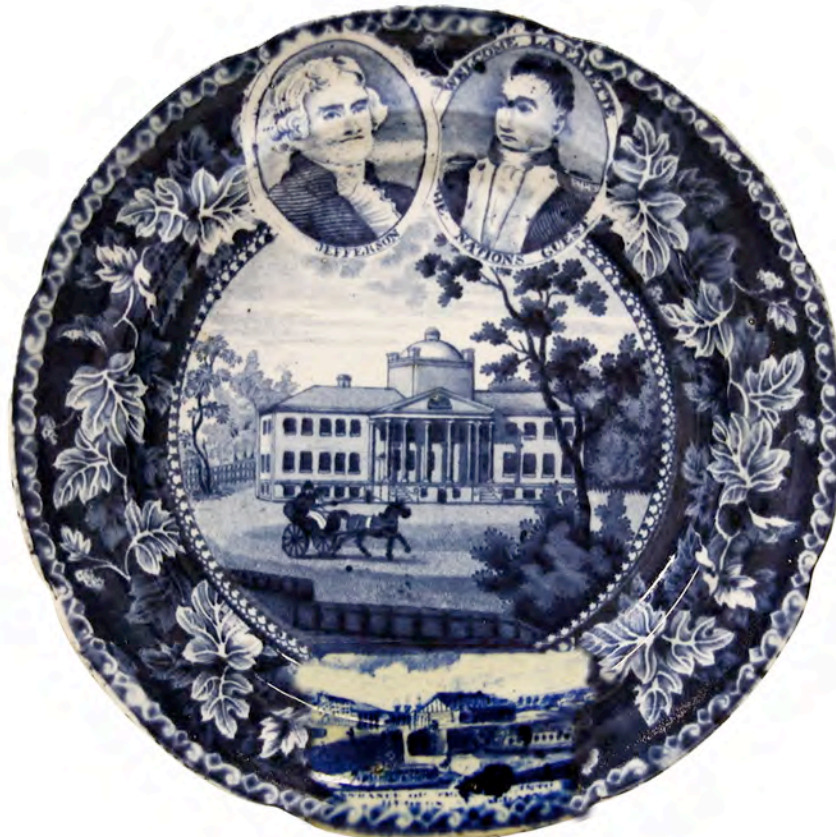
06: -Plate, 2 medallions, c vignette, Ralph Stevenson, Arman 427.