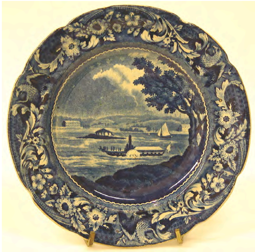
07: Plate, Joseph Stubbs, "View at Hurl Gate, East River", Arman 333.