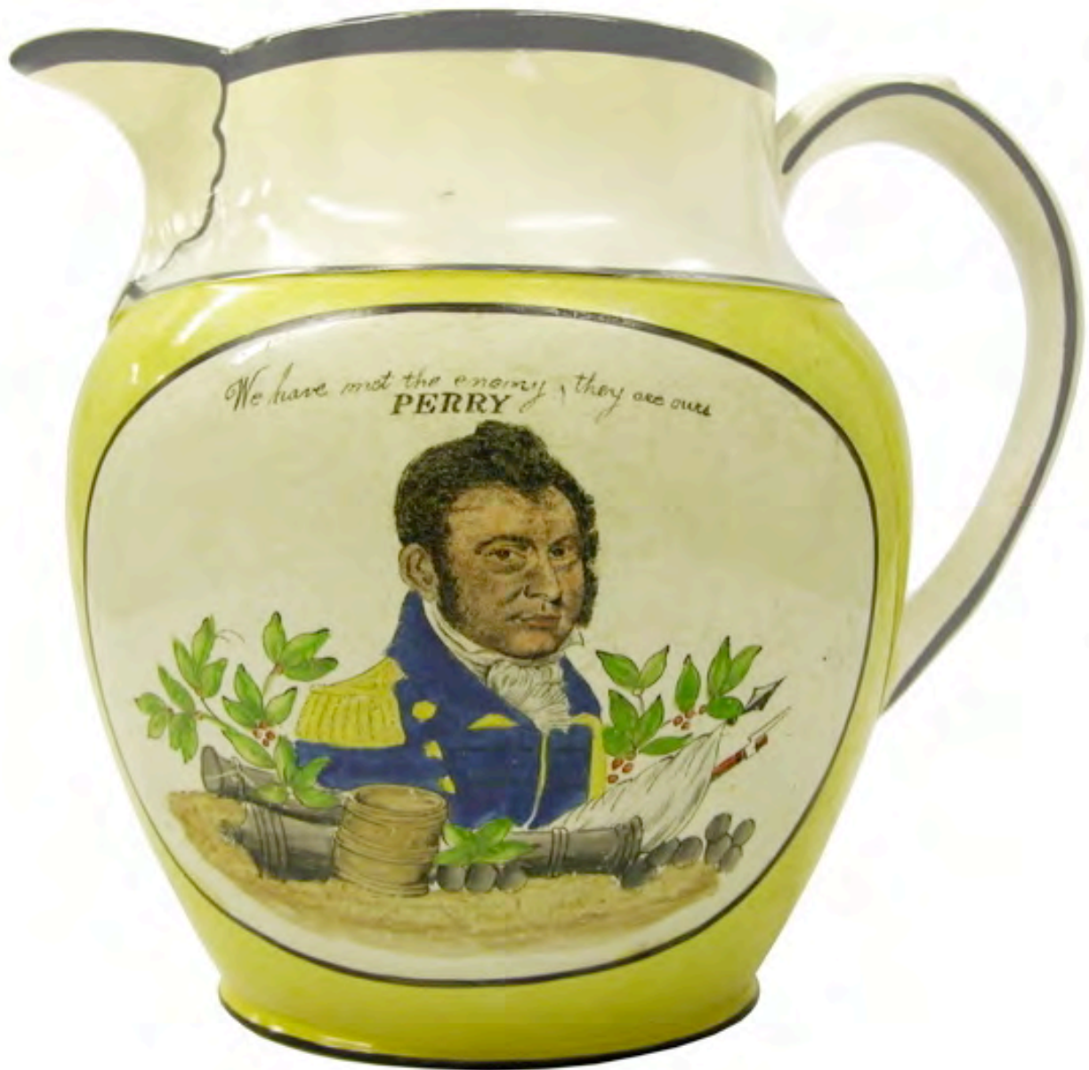
43: Pitcher, " We have met the enemy, they are ours" and the name "Perry", reverse side undetermined, Maker Unknown, Reference unavailable, reverse side undetermined.