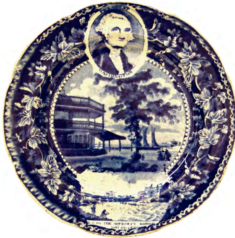
05: Plate, one medallion, b vignette, Ralph Stevenson, Arman 433.