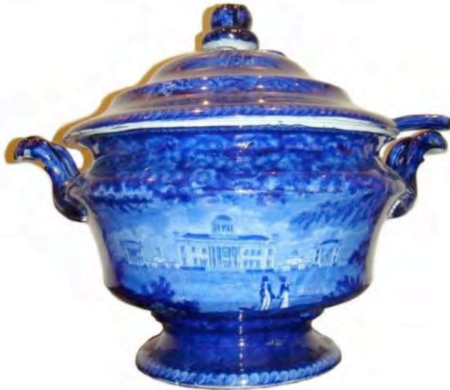
12: Soup tureen w/ cover, "Capitol at Harrisburg, Pa"(image from TCC Pattern and Source Print Database)