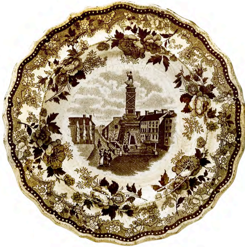
25: Plate, "Baltimore, Battle Monument". J & J Jackson, lighter colors, Arman 467.