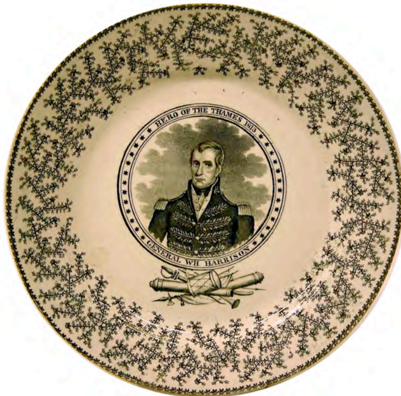
30: Plate, "General W. H. Harrison, Hero of the Thames, 1813", with chickweed border, black, Arman 515B.