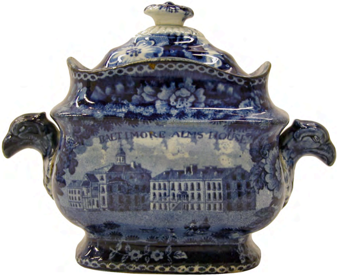
14: Sugar Bowl, Eagle-head handles, "Baltimore Almshouse", Maker Unknown, Arman 591. Fewer than three examples are known with eagle's head handles.