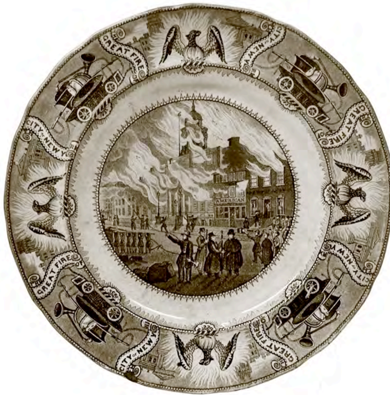
22: Plate, "New York, Burning of the Merchant's Exchange", Dimmock, lighter color, Arman 605.