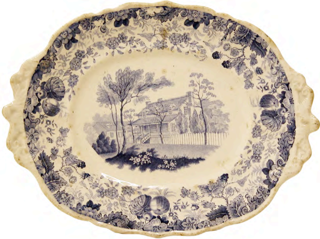
19: Platter, "Riceborough, Georgia, Enoch Wood and Sons, lighter color, Arman 248.