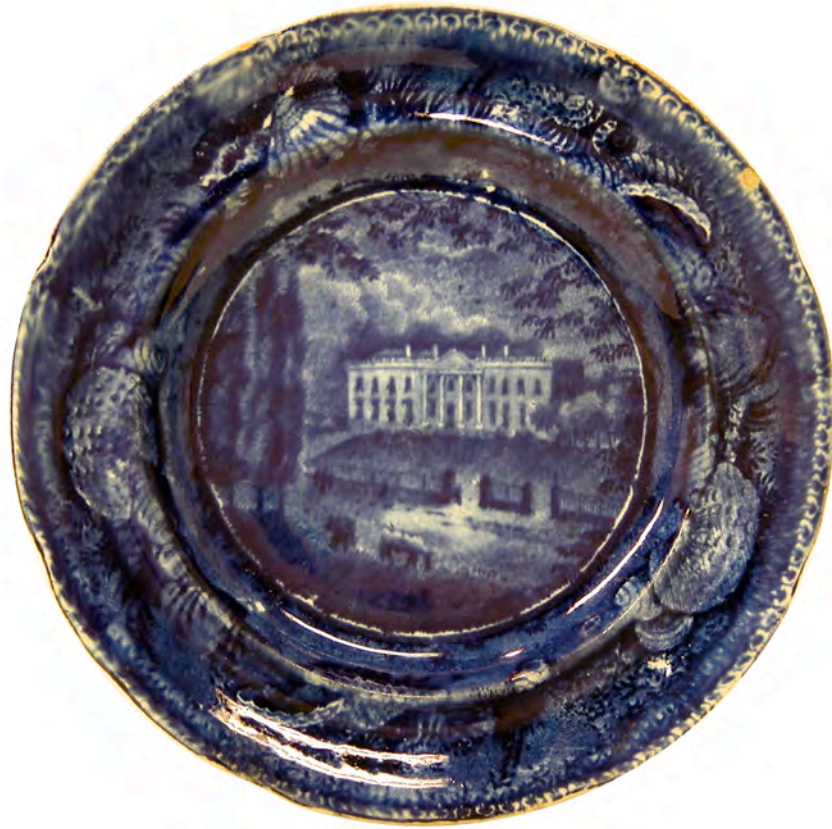
16: Toddy Plate, "White House, Washington", E. Wood & Sons, Arman 189.