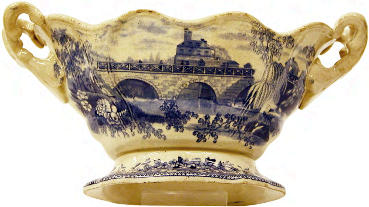
17: Gravy tureen, very rare "Race Bridge, Philadelphia", Enoch Wood, lighter color, Arman 233.