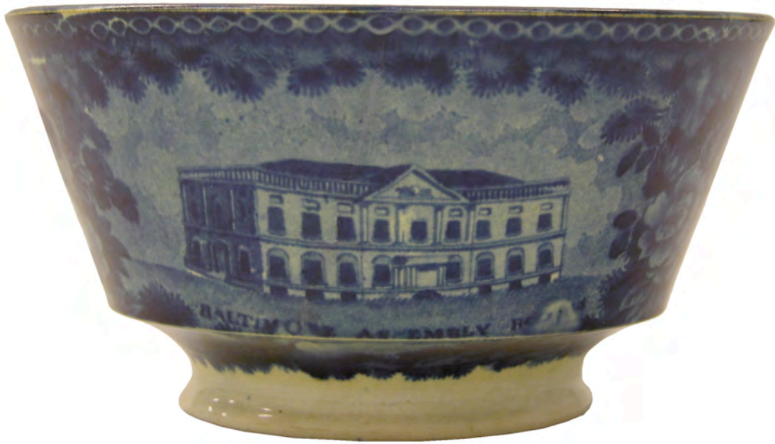
15: Waste Bowl, "Baltimore Assembly Rooms", Maker Unknown, Arman 592.