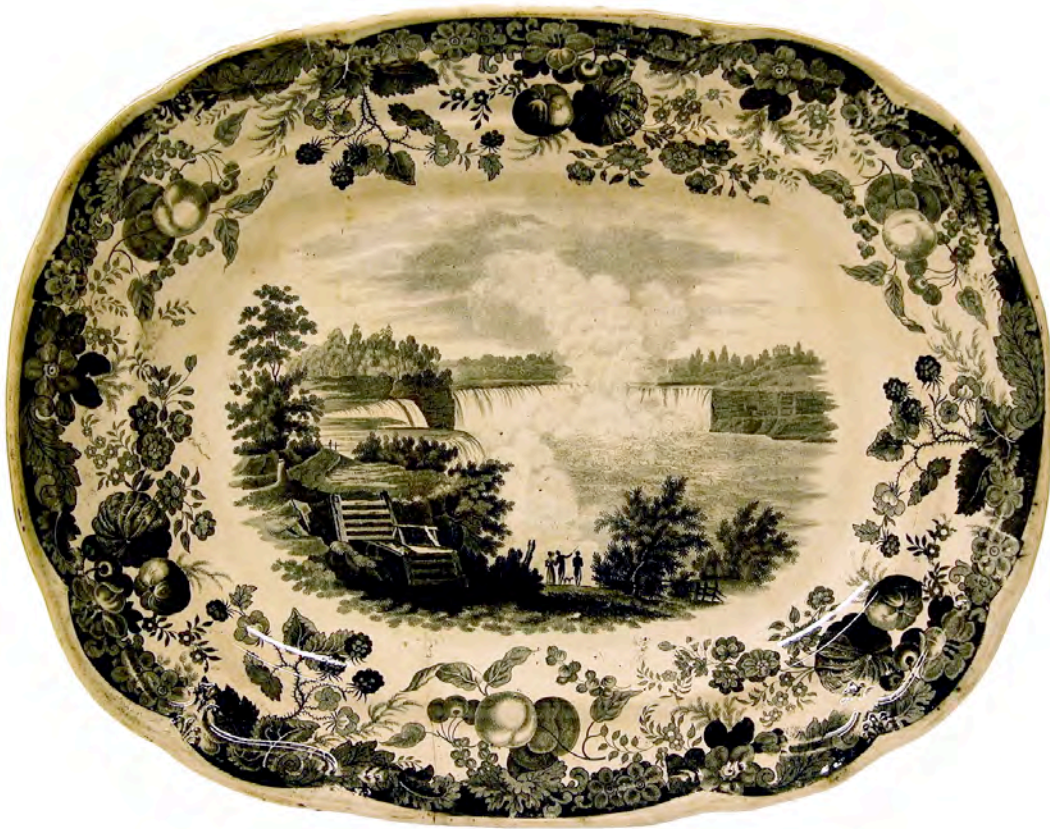
18: Platter, "Niagara Falls", Enoch Wood and Sons, lighter color, Arman 246.