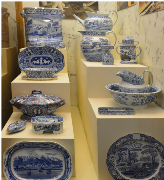
Visitor Center Display. This display of Spode's blue and white is only a small sampling of the Centre's attractions and a very small part of the ceramic collection as a whole.