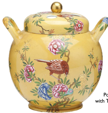
Spode Pot Pourri Vase with Tumbledown Dick Pattern