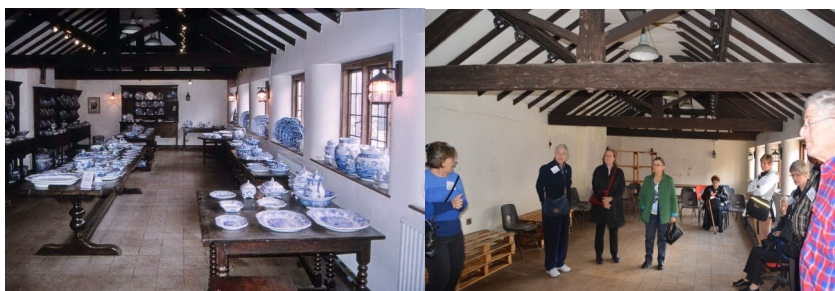
Famous Spode Blue Room c. 2003

provide funding in support of the future Spode Museum. The Trust Joins with the City Council's long term plans to bring vacant historic buildings on the site back into use. As such, the Trust will dedicate its efforts to re-establishing a museum exhibition site which will take into consideration all the valuable trust collection.