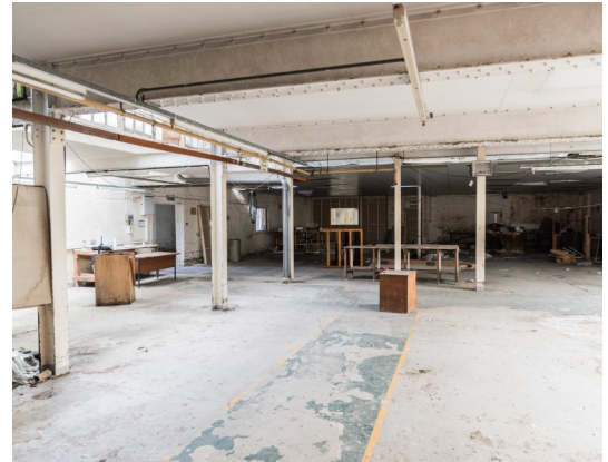
Space on the historic Spode factory site planned for the new museum.

To learn more about the Spode Museum Trust initiatives, go to : www.spodemuseumtrust.org/spode-museum-friends.html