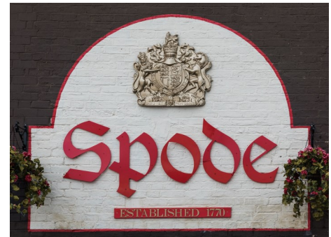
Iconic Spode Logo