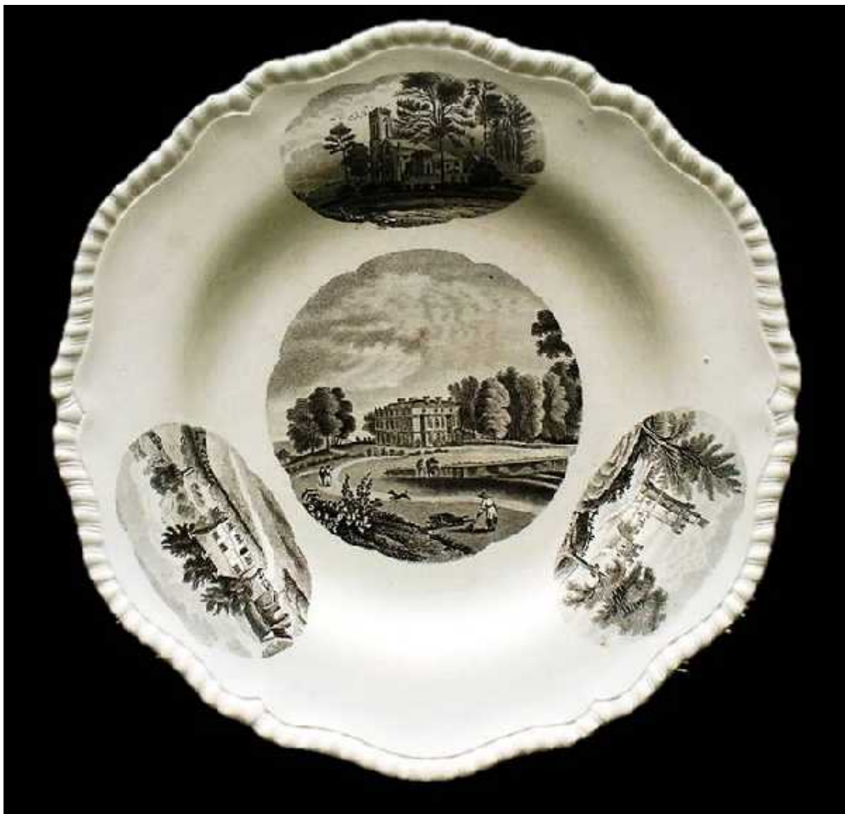
Fig 2 - An unfinished vi Spode Bateman plate, earthenware, bat printed

It is known that the Batemans were customers of Spode as pottery exists designed especially for them (Figs 2 and 3).