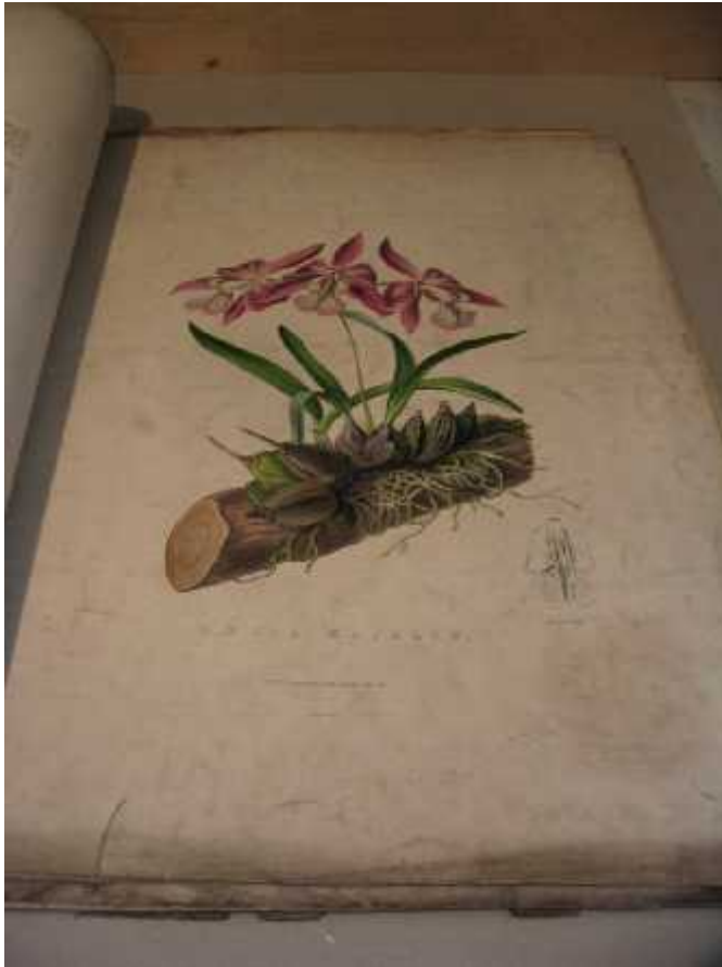
Fig 15 - The Orchidaceae of Mexico and Guatemala (prior to conservation); illustration 23 1840 Laelia majalis.

From 1847 and for the remainder of the 19th century the Spode pattern books feature few single botanical specimens as centres for designs and this fashion for the majority of customers seems to have disappeared. Flowers are seen in thousands of designs depicted in vases, swags, groups, bunches and sprays. Orchids do appear more than before but are seen combined with other flowers, foliage, butterflies and birds. They are used on the most expensive and elaborately