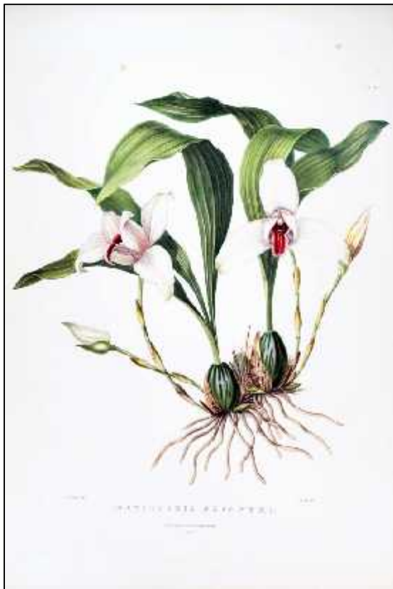
Fig 17a - The Orchidaceae of Mexico and Guatemala xxxii illustration 35 1842 Maxillaria skinneri xxxii

Guatemala illustration 35 Maxillaria skinneri (Fig 17). The suffix skinneri in honour of one of Bateman's important orchid hunters, George Ure Skinner.