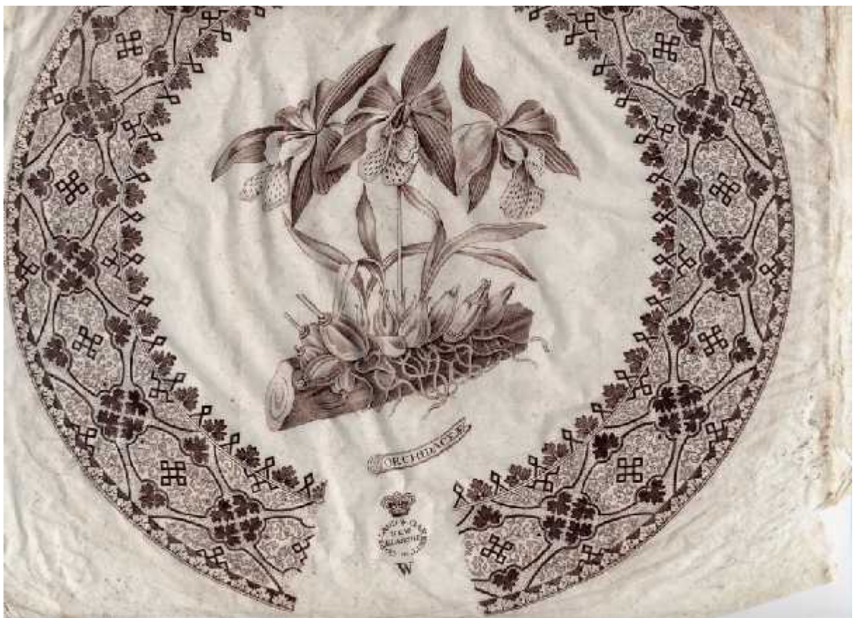
Fig 7 - Detail of pull xxi from copper plate engraved with a design from illustration 23 of The Orchidaceae of Mexico and Guatemala (see Fig 15)

I realised immediately that the design was taken directly from The Orchidaceae of Mexico and Guatemala . It is from illustration 23 of 1840, Laelia majalis .