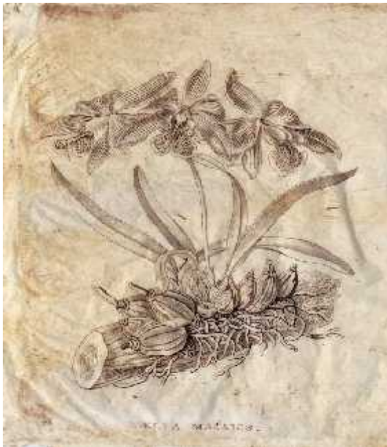
Figs 10-14 - Pulls from copper plates with engravings after illustrations in The Orchidaceae of Mexico and Guatemala. The book illustration for Fig 11 can be seen in Fig 4

Paul and I also found other orchid engravings in the copper plate store and these are shown in Figs 10 to 14 as pulls printed onto sheets of specially prepared thin tissue paper. The book illustration for Fig 11 can partly be seen in Fig 4 as the first fragment I found. The Spode engraving obviously done when the book was still in pristine condition.