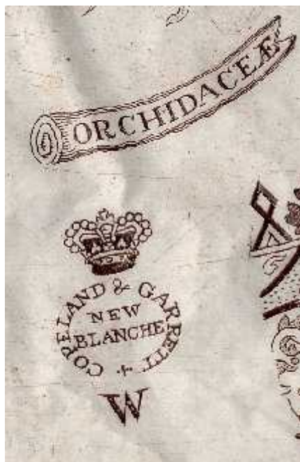
Fig 9 - Details of the original Copeland & Garrett backstamp

originally hand coloured over the print? Were other illustrations from The Orchidaceae of Mexico and Guatemala also used as part of this pattern? In what colour was it originally printed and who was W? Hopefully pieces from, and perhaps documentation about, this pattern will eventually turn up somewhere and answers will be found to these questions.