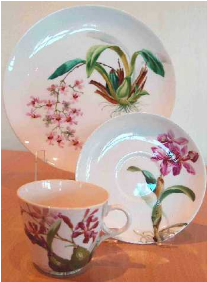
Fig 16 - Cup, saucer and plate

As mentioned above Spode orchid patterns are also known on actual pieces but are not recorded in the pattern books. These were probably specially commissioned designs. Producing specially commissioned designs was big and important business for the Spode company from the very early days of the company in the 18th century through until the mid-1990s.