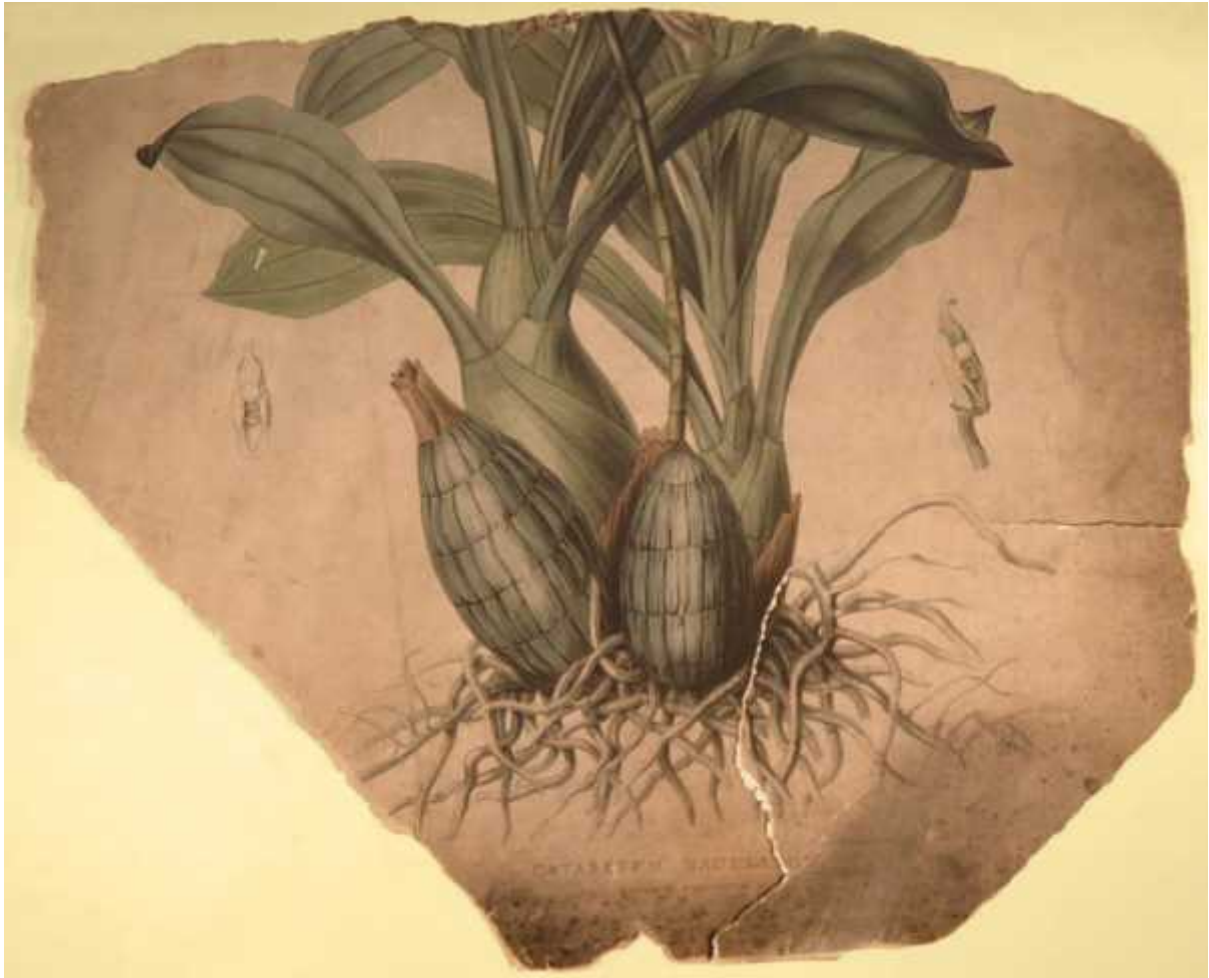
Fig 4 - The first fragment of The Orchidaceae of Mexico and Guatemala I found - Catasetum maculatum