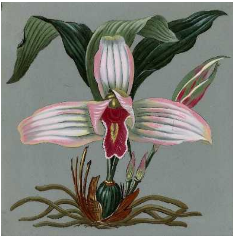
Fig 17 - Copeland tile c1860s, sage green clay, printed and hand coloured - Maxillaria skinneri source print Fig 17a

Some of the watercolour orchids in the designers' sketchbooks are from The Orchidaceae of Mexico and Guatemala and are adapted to a more manageable size, as well as arranging the flower to fit a round plate or three-dimensional object. Others orchids are from as yet undiscovered sources. Were some sketched from life? A few have a local place name added under the Latin name of the flower perhaps suggesting access to a local 'grand' house where orchids could be seen and studied.