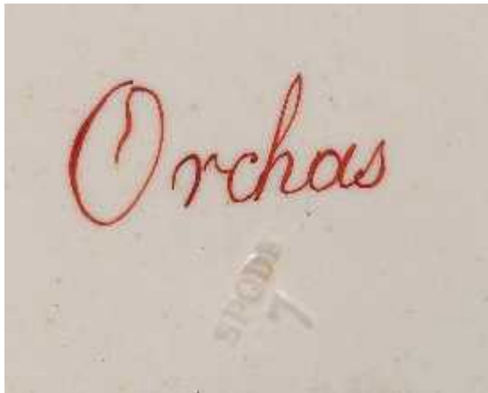
Fig 6a - Orchas plate backstamp

As well as patterns recorded on paper from the early 1800s to c1998 the Spode archive held a collection of copper plates (approx. 25,000 in 2007) engraved with designs usually not recorded elsewhere. Orchid hunting amongst these copper plates with the much-needed assistance of Paul Holdway xx I looked in an unmarked pen of coppers adjacent to one labelled with flower names. My theory that items are often misfiled over years paid off. The coppers are heavy to manipulate and I could just see an interesting orchid-like outline on the grubby copper plate. With Paul's assistance I drew out an exquisitely engraved copper featuring an equally exquisite orchid.