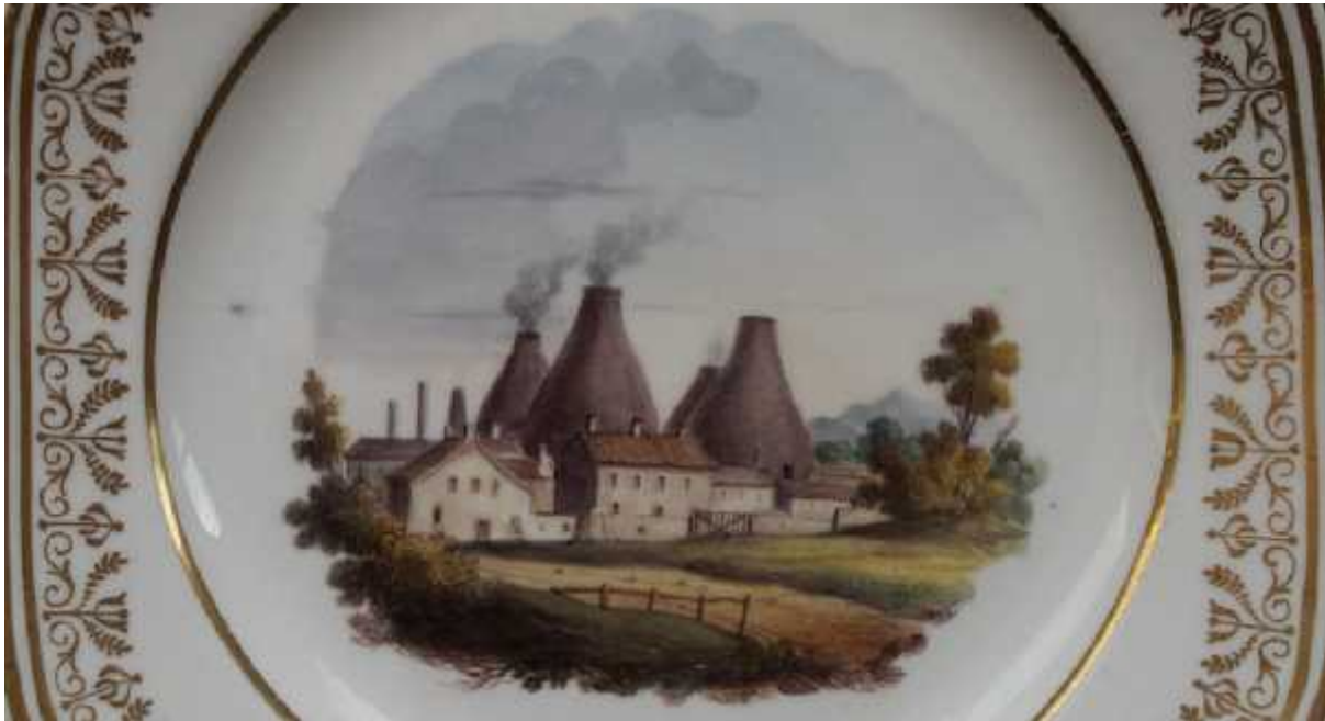
Fig 1 - Spode bone china plate (detail) showing the Spode 'potworks', handpainted, c1800 (private collection)

In the late 1700s the business was described as potworks with meadow adjoining (Fig 1). The Meadow name lived on up to the end of production at Spode in 2009 still identifying a building on the site.