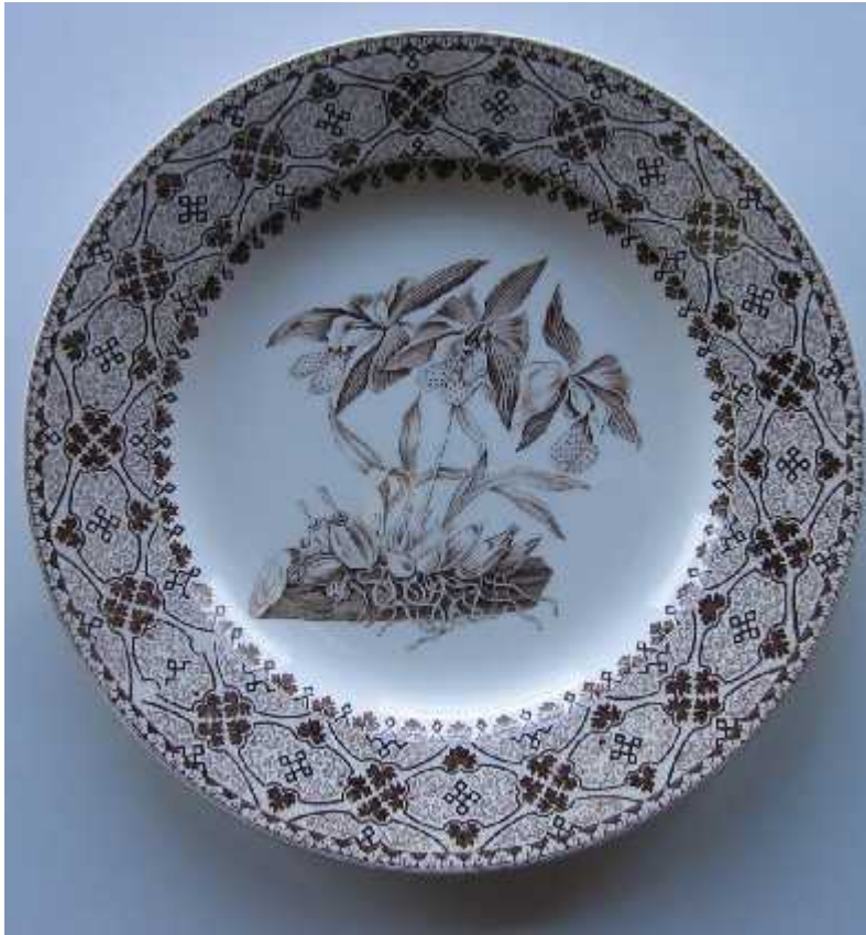
Fig 8 - The plate produced for me at Spode from the antique copper plate, c2004

The design seemed to have been engraved to fit a 10 inch plate, usually used as a dinner plate, but were other pieces produced to make a whole dinner service? Paul kindly prepared the copper plate and arranged for a few earthenware plates xxii to be printed at Spode. It was convenient to print it in brown (Fig 8). Was it