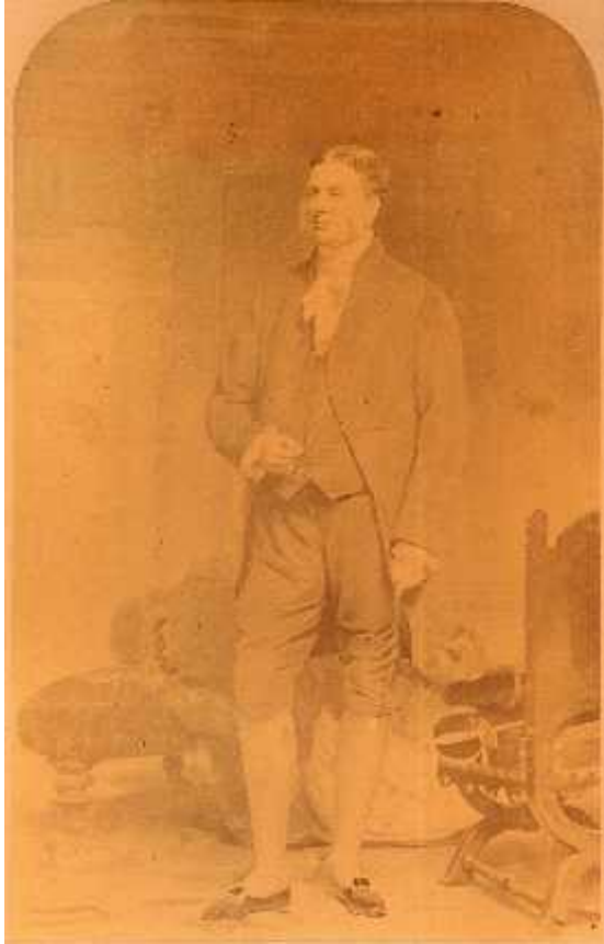
Fig 5 - William Taylor Copeland, formal photographic portrait, between 1864 & 1868

It was not surprising then that James Bateman should approach this altruistic North Staffordshire entrepreneur for sponsorship for his big and expensive project. After all it has been shown that the Bateman family were already customers of the Spode company and perhaps they were even acquaintances of the Copelands. It is possible that W. T. Copeland had botanical interests amongst all his other activities even if it only extended to the grounds and rural surroundings of the estate around his beautiful home. Certainly members of his family went on to have interests in botany xix .