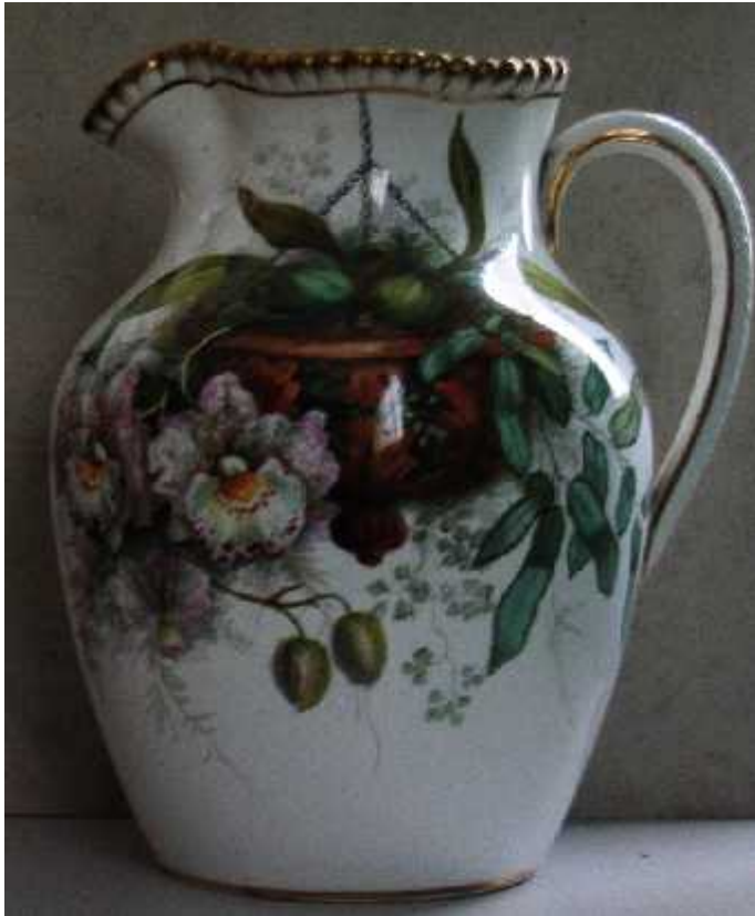
Fig 19: Ewer from a toilet set painted by Thomas Sadler