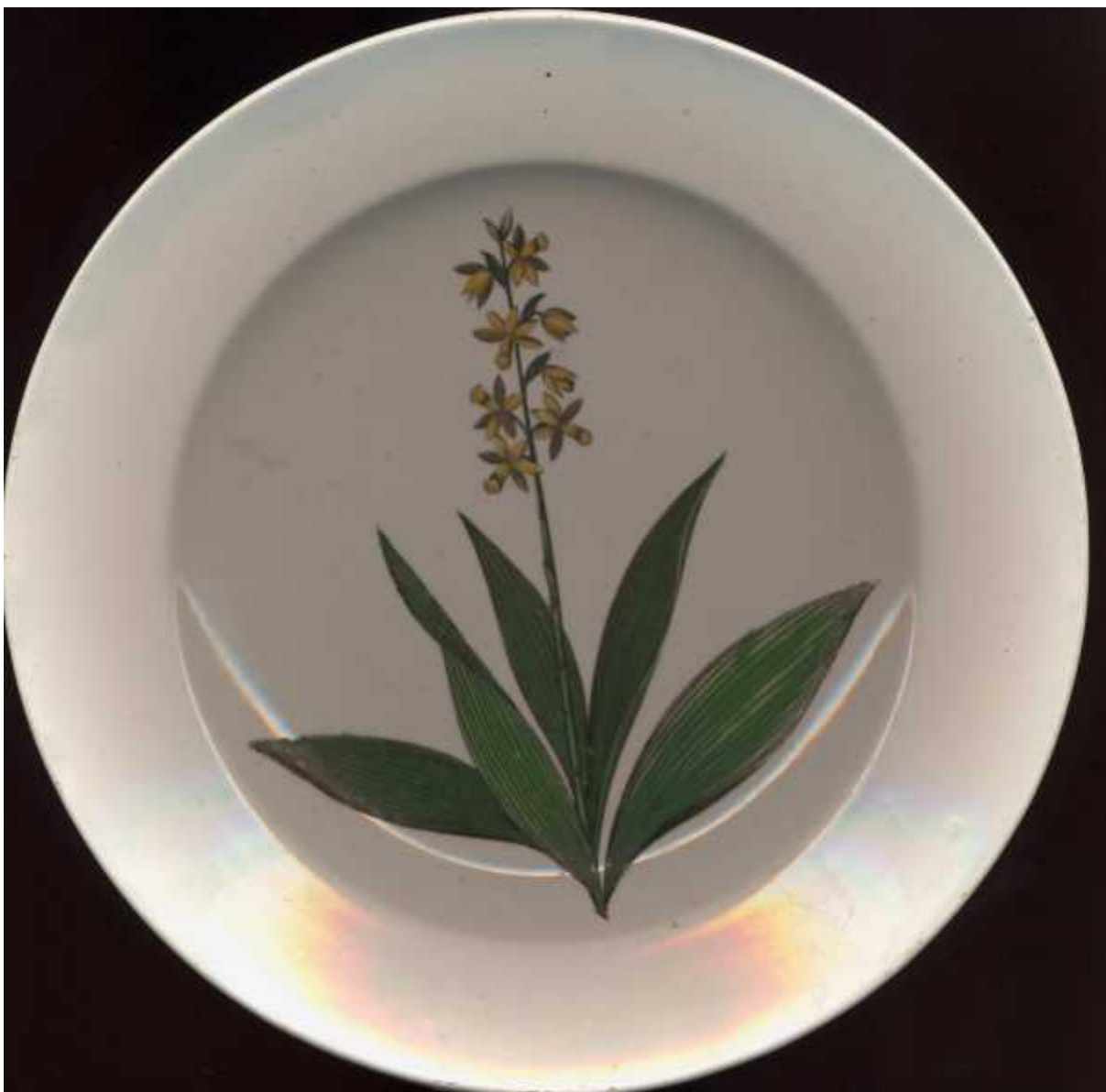
Fig 6 - Orchas plate c1800

pattern records on paper, suggesting these may be special commissions. In one case I had not spotted a record during my research as there was only a written entry in the pattern book and no illustration. This is pattern number 1019 c1808 and it features an ' Orchas ' centre surrounded by scattered insects and shells in red and gold. The same centre was used for a different design, not recorded on paper, for the plate in Fig 6. The pattern, probably produced before the development of printing in green, is printed in black and then hand coloured in green and yellow. Fig 6a shows the handpainted name ' Orchas ' and the backstamp. The source for this ' Orchas ' has not yet been found.