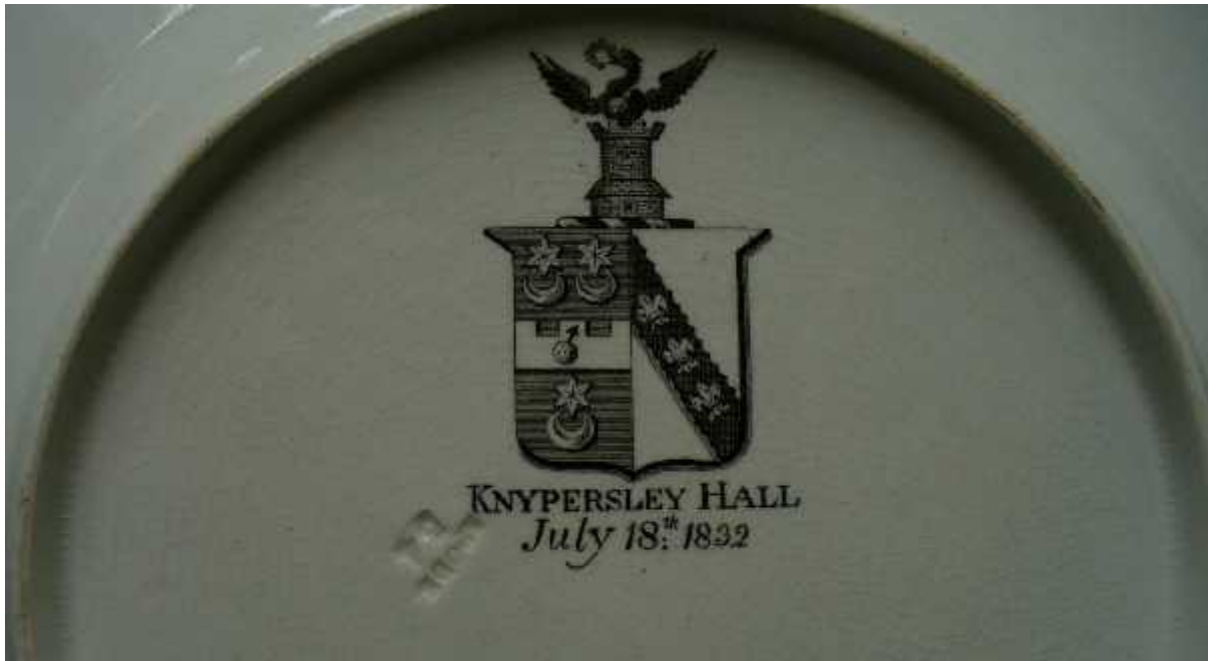
Fig 3 - The reverse of the Spode Bateman plate and its backstamp vii

The plates are dated on the reverse and have a coat of arms included in the backstamp along with the name of the Bateman home - Knypersley Hall. These details associate the plates directly with James Bateman as the arms are those of the Bateman family and the date July 18th 1832 is significant: James's 21st birthday. The original order is lost and only dessert plates seem to exist so perhaps these were not part of a full dessert service but made especially for the occasion perhaps for a special party or to give away as gifts to friends and relations.