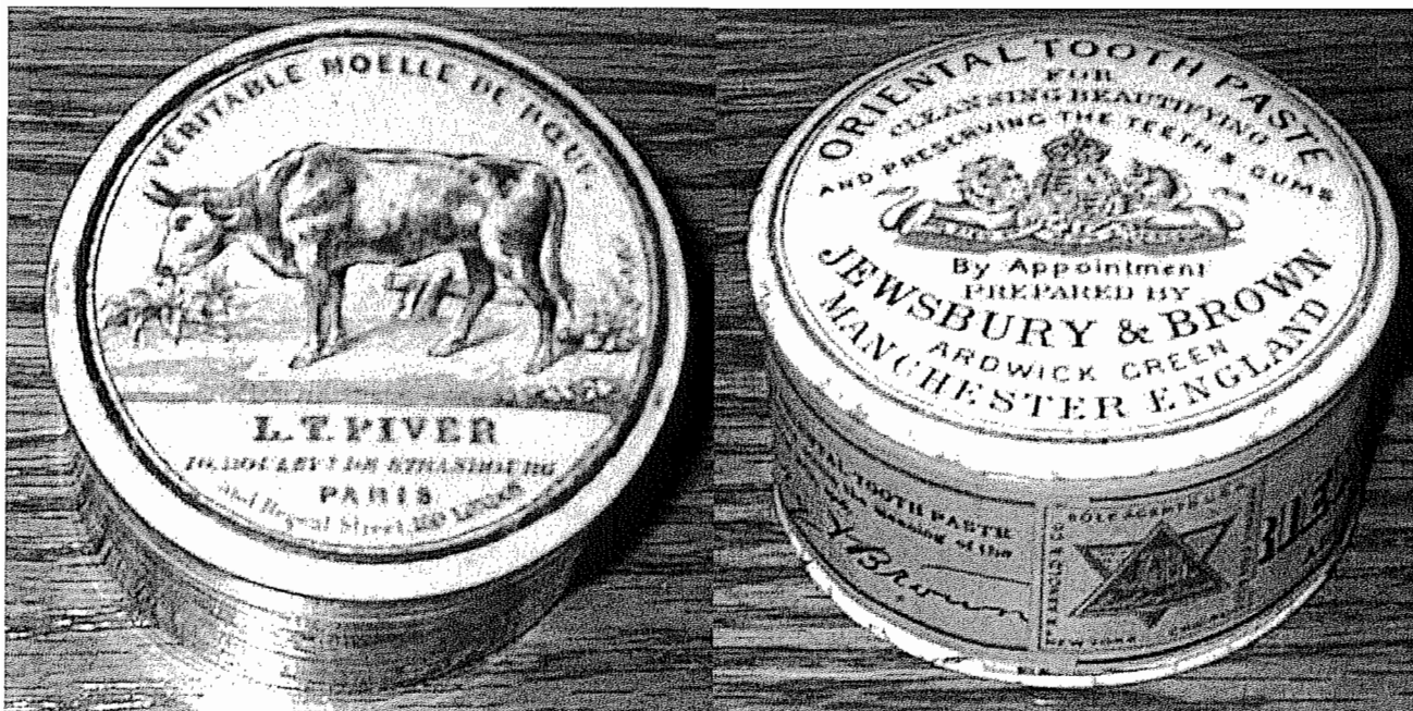
A9 - “Moelle de Boeuf” pomade, blue print

The lid (top) is most commonly available. Although inclusion of the base may increase the value of the piece, it is often missing or mismatched to the top, and thus plays a secondary role to determination of the value. The bases commonly were not printed. However, some of the lids included printed bases, and these, in some cases, add to the value of the pot lid.