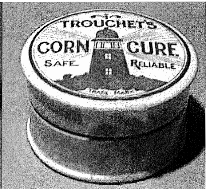
A6 - Bright red transfer, Australian Market