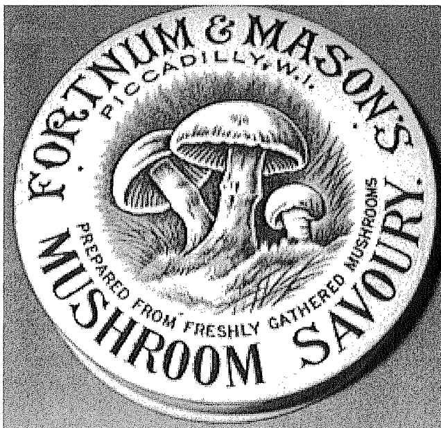
A3 - Fortnum & Mason's Mushroom Savoury