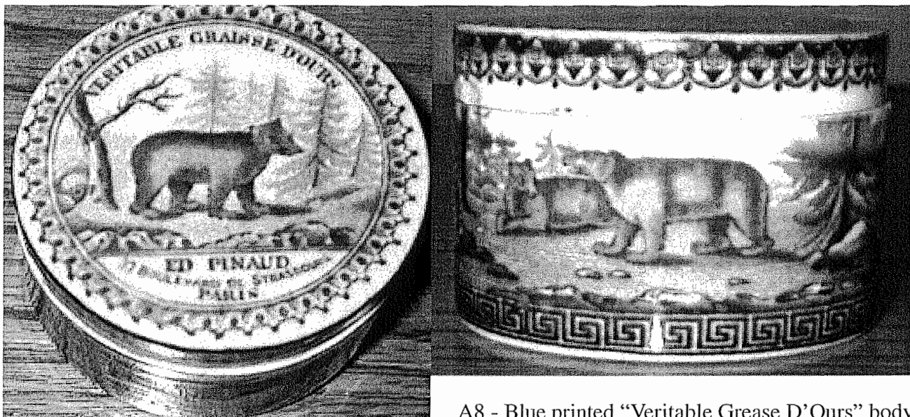
A7 - Ed Pinaud bear's grease pomade lid

The use of pot lids by American suppliers followed that of the English. The American lids were manufactured by English potteries, and were generally monochrome transferred. Most American lids feature original art work. A few, however, appear to have been near copies of popular English lids, in order to capitalize on the success of the English product. Whereas the English lids number in the thousands, less than one hundred American companies