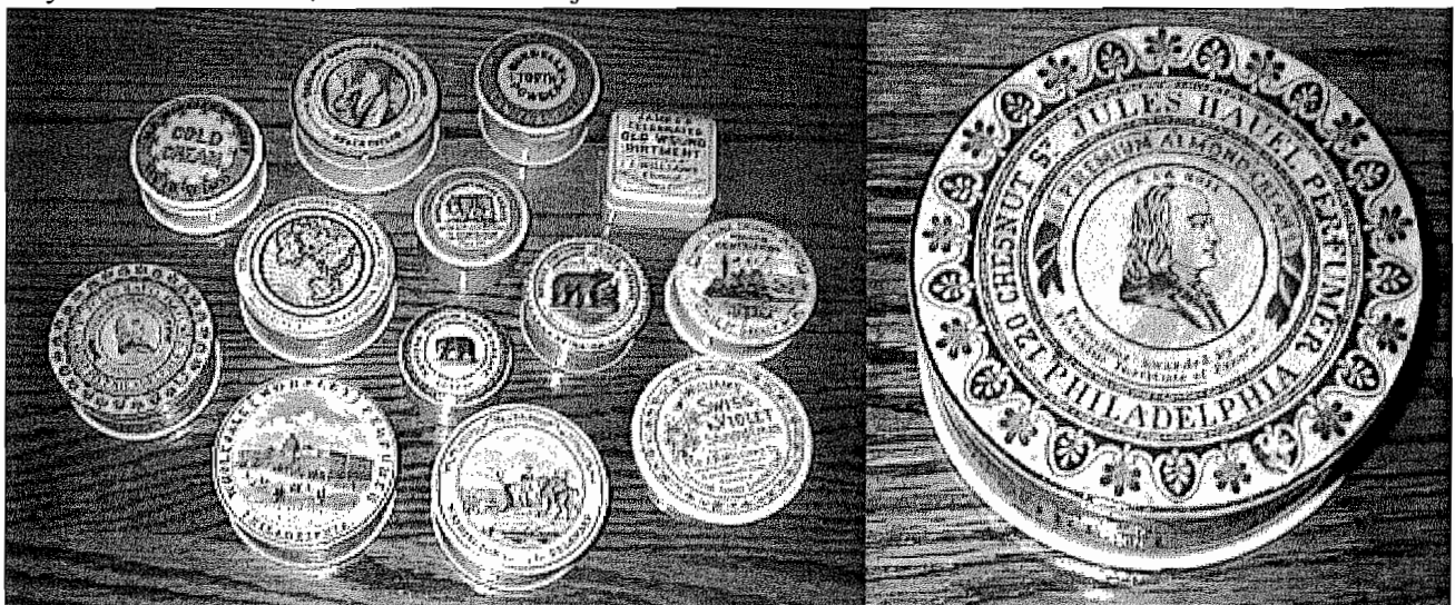
A1 - A sampling of various rare and unusual pot lids

Transfer printed pot lids were manufactured of earthenware, in much the same way as the transferware dinner, tea and other wares of the period. The pot lids discussed in this article are transfer printed under the glaze, generally in black on a white background, but occasionally in blue, green, red or brown. During the 1840's, however, F & R. Pratt and T. J. & J. Mayer introduced lids printed in blue against a colored background. Subsequently, Pratt developed a method of multi-colored printing. These lids, which portrayed pictorial scenes, came to be known as "Prattware". Pratt lids feature varied topics, and are popular among collectors. However, they do not feature text, and are not the subject of this article.