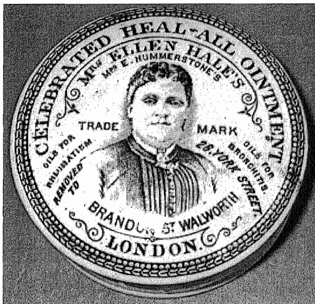
A5 - Mrs. Hale's Celebrated Heal-All Ointment

Cold cream pot lids are the most common following toothpaste. The use of cold cream dates to at least the second century AD. The first formula published in England appeared in 1618. Cold cream pot lids often feature floral patterns, and can be quite charming. They first appeared in the 1870s; the product was produced by individual chemists, and their names were printed on the lids. Wholesalers began mass producing cold cream in the 1880s. The pots became more generic, with cold cream printed on the lid. Paper labels identified the private pharmacist who resold the pots and their contents.