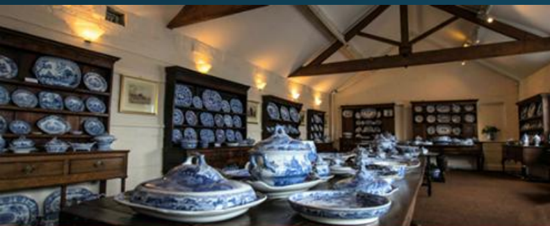
The Spode Museum Trust Heritage Centre