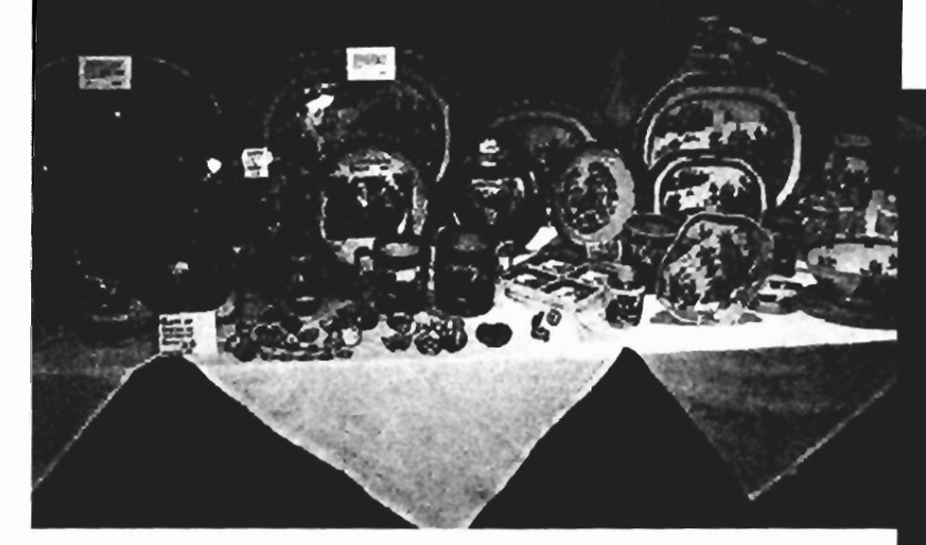
Rita Cohen showing early blue chinoiserie.