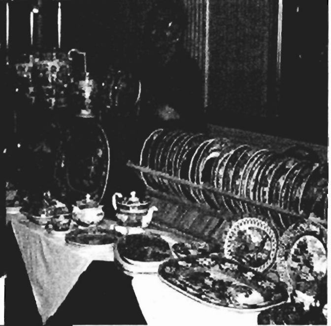
Dora Landey with a beautiful selection of blue transferware!