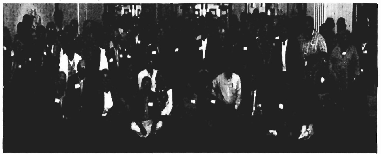
The entire group together at the Third Annual Meeting, 2002!

Our third annual meeting welcomed members from all over the US and Great Britain. Over 100 members attended, our largest meeting to date.