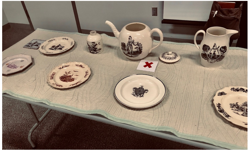
Historic Deerfield collection

In the afternoon, attendees travelled to Historic Deerfield's museum building, the Flynt Center of Early New England Life, for an object-handling workshop. Many of the items discussed in Sousa's and Lange's presentations were available for closer inspection, as well as many of the museum's transferware treasures. Several recent museum acquisitions were highlighted, including a beautiful soup tureen and under tray from John and William Ridgway's "Beauties of America" series, an oversized yellow-glazed pitcher, and a transfer printing copper plate engraved with the Willow pattern. The day ended with tours of Historic Deerfield's Wells-Thorn House and Frary House.