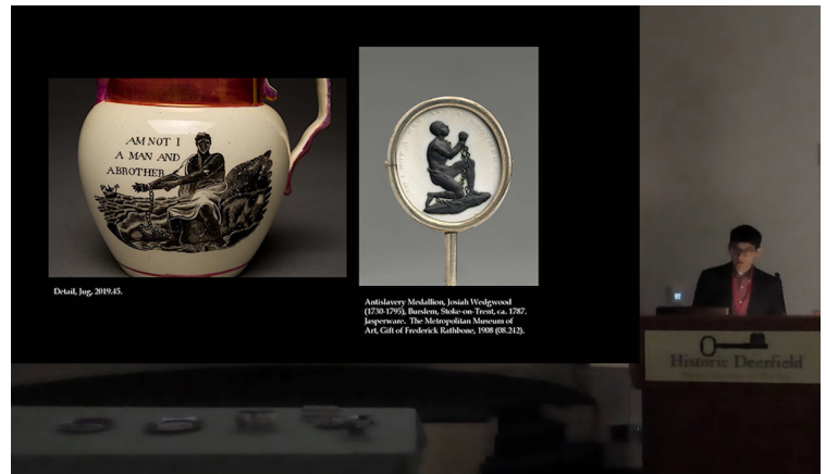
Anti Slavery Ceramics at Historic Deerfield by Dan Sousa

The day began with two presentations by Historic Deerfield staff members, Dan Sousa and Amanda Lange, who discussed the museum's growing anti-slavery ceramics collection as well as early and noteworthy examples of British transferware at Historic Deerfield. Following the presentations, TCC members discussed items from their personal collections during a show-and-tell session. The items discussed included two Wedgwood commemorative plates depicting the Battle at Lexington and the Battle at Concord's North Bridge, respectively; an Enoch Wood & Sons plate with a view of "Cathedral at York"; a mug commemorating the coronation of England's King George VI; two "Caledonia" pattern jugs by William Adams & Sons; a bourdaloue decorated in the "2 Temples 2" pattern; several feeders; and a toiletry or toothbrush box. Perhaps the most perplexing item from the group was one of the "Caledonia" jugs—believed to be a puzzle jug—which had a hole at the top of the handle as well as a hole in the underside of the base that did not extend all the way through the bottom.