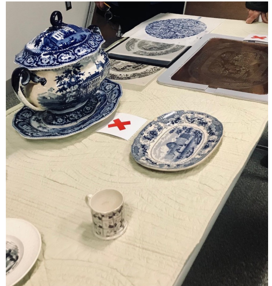
Historic Deerfield collection