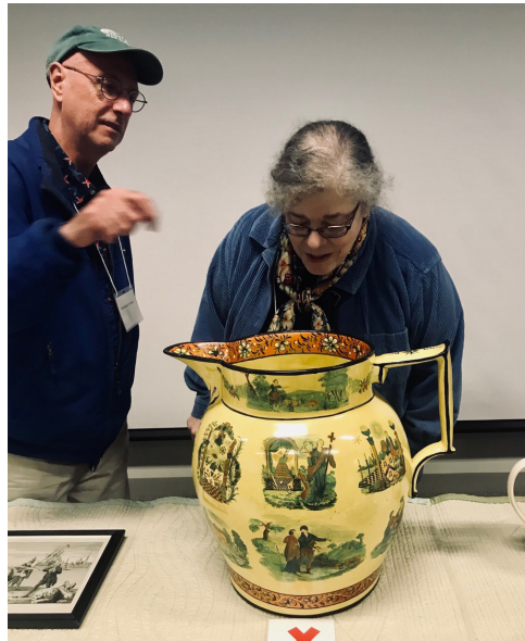
Participants examining exceptional Historic Deerfield jug