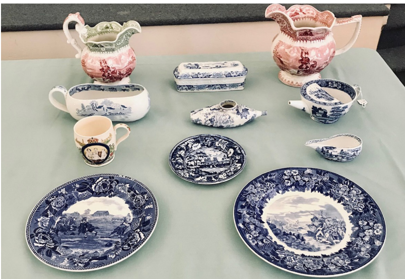
Show and tell examples