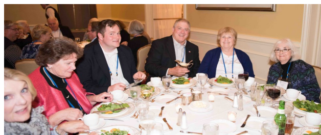
Members enjoy dinner at the DuPont Country Club