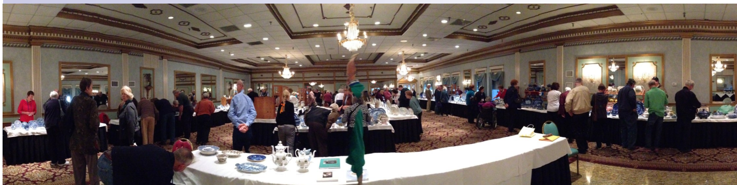
Sunday Show & Sale

I was happy to see that everyone was wide awake for Sunday breakfast which was followed by a very interesting and spirited talk titled Social Media and its Benefits for Collectors .