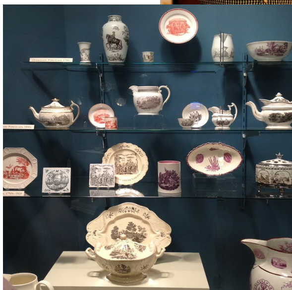
One section of the Winterthur/TCC Transferware Exhibit, Transferware: A Story of Pattern & Color