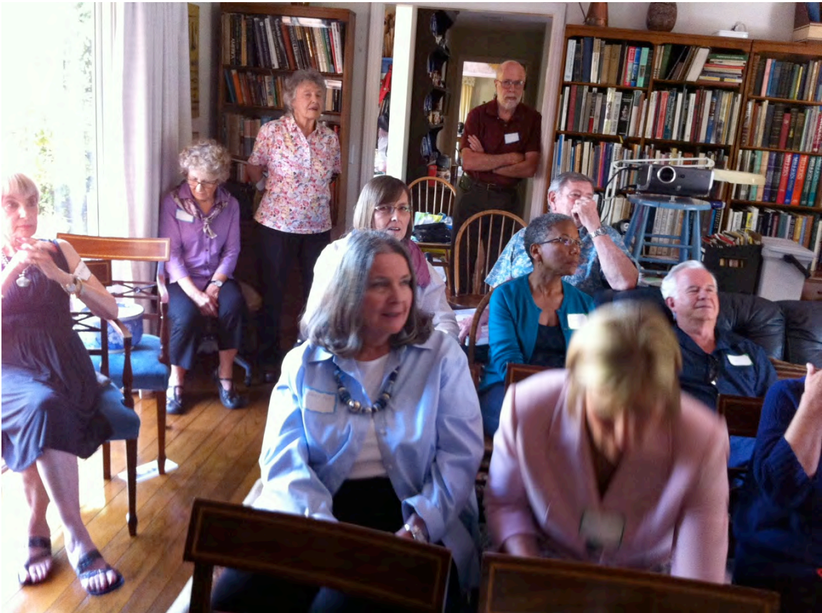
Part of the group