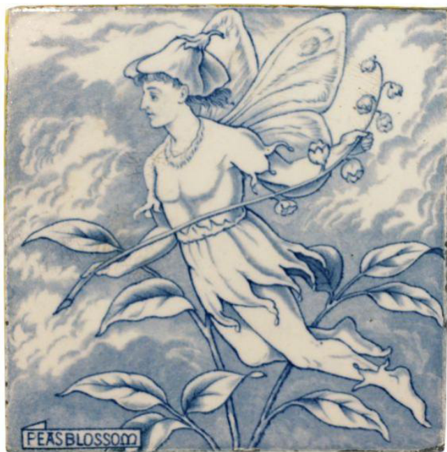
Figure 8. “Peas Blossom”

We also see the remnants of glaze and glue used to attach the tile to a