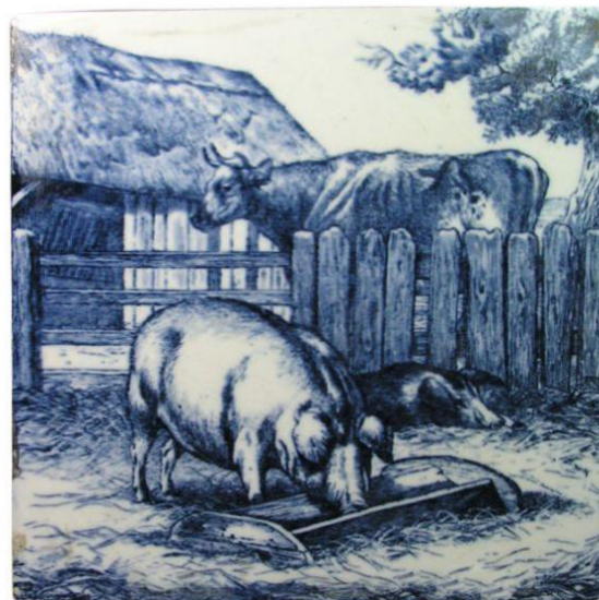
Figure 4. "Pig at Trough"