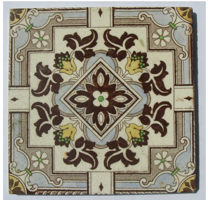
Figure 13. "T.245"