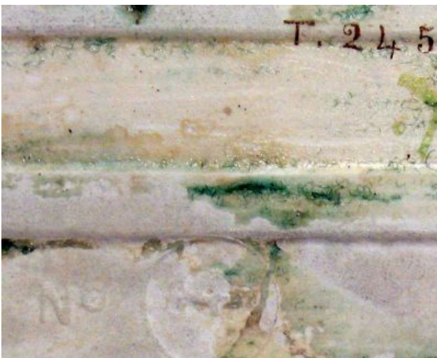
Figure 14. Tile back "T.245"