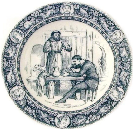
Figure 5. "Friar Tuck Entertains the Black Knight"