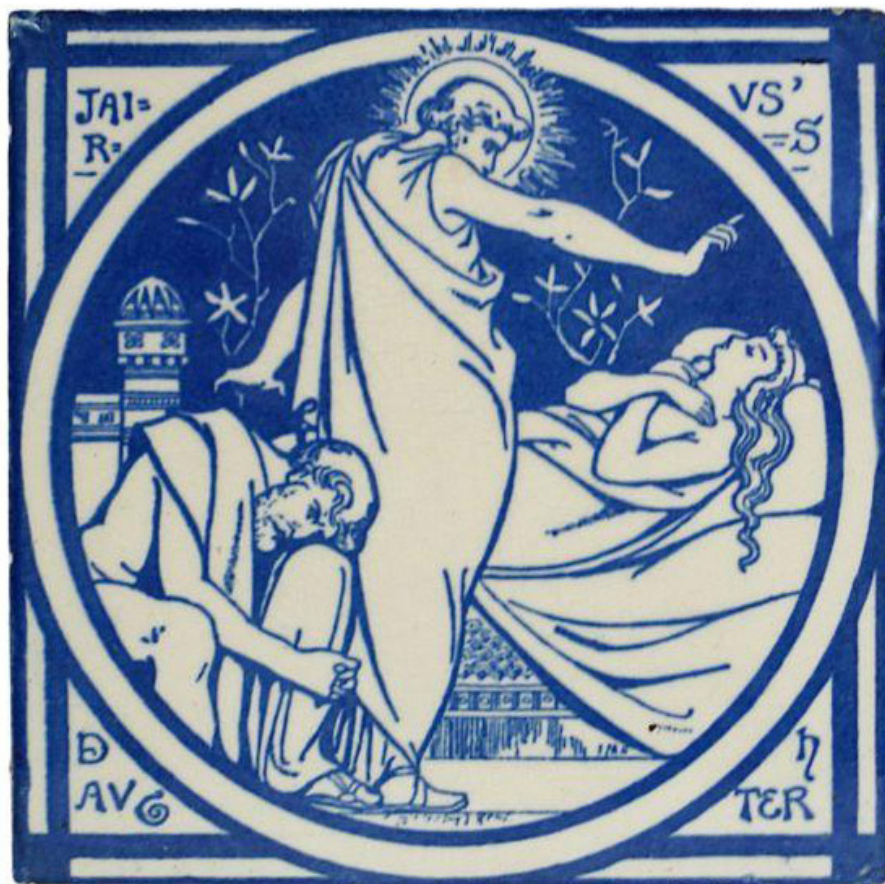
Figure 1. Jarius' Daughter