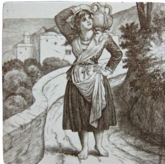
Figure 3. "Girl with Urn"