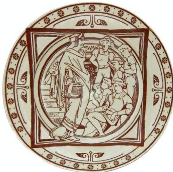
Figure 2. "Six Swans"