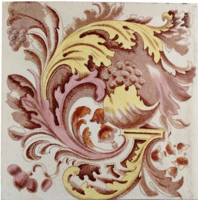
Figure 12. "Fruit and Foliage Swirl"

Collecting of tiles probably began in earnest during the 1960s and 1970s when many Victorian properties in the U.K. were demolished. All types of Victorian tiles taken from these buildings were available in abundance. Later, the source of the supply diminished as the emphasis shifted to preserving the tiles in situ. In the 21st century, reclaimed tiles are available. Many books have been written on the subject, and the TCC Database is doing its part by researching and recording patterns. I would be pleased to hear of your interest in tiles. ■