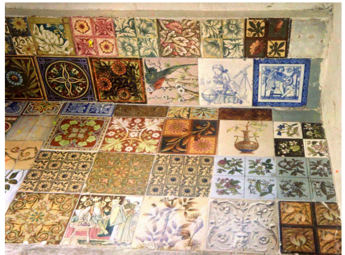
Figure 15. Spode/Copeland Tiles