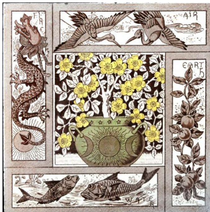
Figure 11. “Fire, Air, Earth, Water”