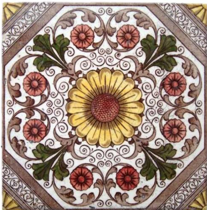
Figure 10. “Sunflower Pattern No. S.1598”