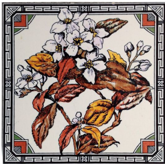
Figure 9. “Dogwood in Bloom”