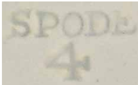
Figure 2. Impressed mark