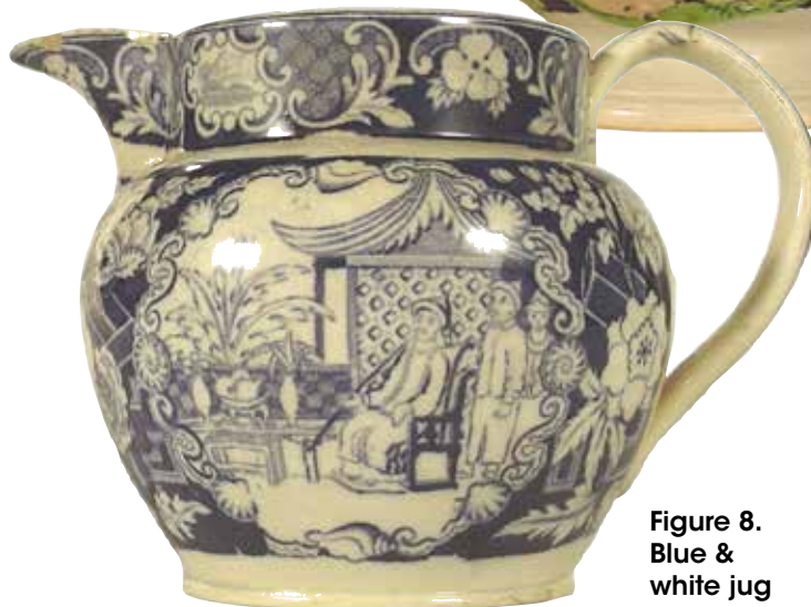
Figure 8. Blue & white jug