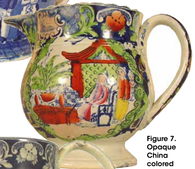
Figure 7. Opaque China colored