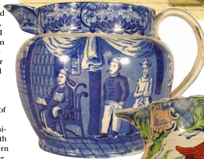
Figure 6. Low Dutch jug