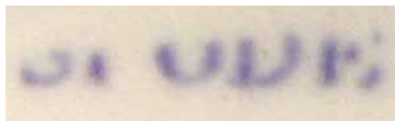
Figure 3. Printed mark