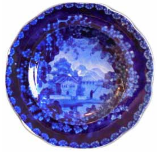
Fig. 17 "Three Story House" (assigned name) for 7" diameter plate with impressed AWS eagle mark.