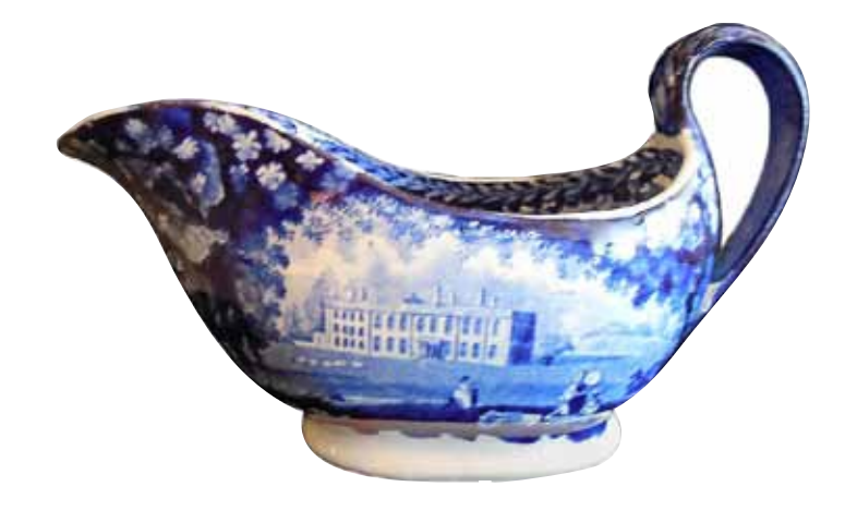
Fig. 19 Fairlawn. This sauce boat is 7 \frac{1}{2} " long (spout to handle) about 3" wide and stands a bit over 4" at the handle and around 2 \frac{1}{2} " high in the low middle. Impressed AWS eagle mark.