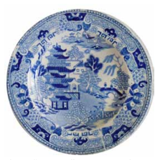
Fig. I I "Broseley" – unnamed willow pattern variation – 4" diameter cup plate, impressed AWS eagle. (Thanks to Connie Rodgers for identification.)