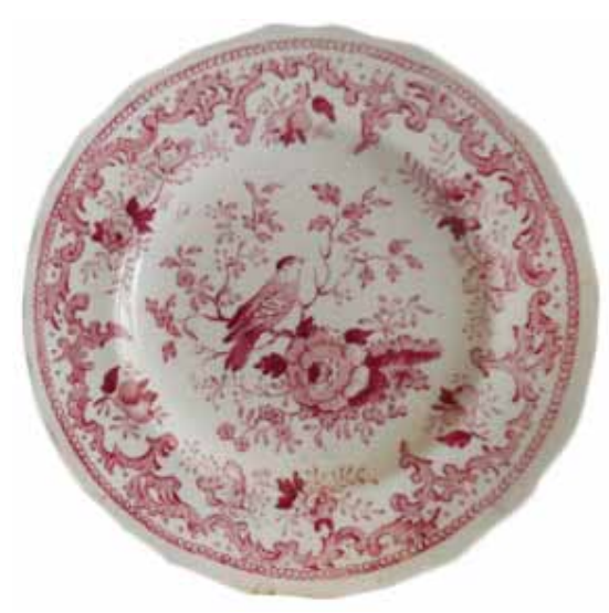
Fig. 16 "Bird with Flower" (assigned name) for 4" diameter cup plate impressed ADAMS.