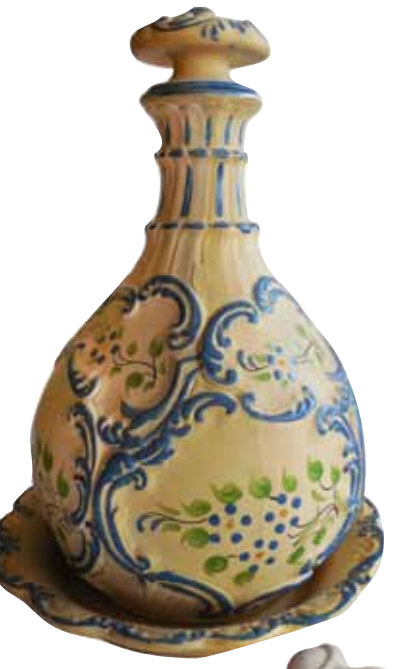
Fig. 20 Wine Decanter. This early three-piece hand-painted earthenware set stands about 10 ½" high, including stopper. The 7" diameter undertray is impressed ADAMS.