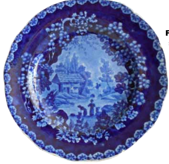
Fig. 13 "Riverside Cottage" (assigned name) for a 7 3/4" diameter plate impressed AWS eagle.