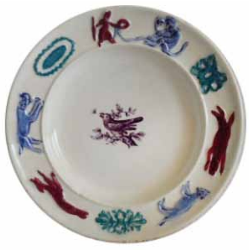
Fig. 10 "Bird" (assigned name) for 5 3/4" child's plate, impressed ADAMS, in same series as "Dalmation" and "Sheep" seen in Adams Ceramics pp 52-53.