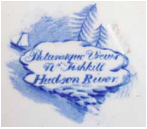
Fig. 9 Picturesque View Nr Fishkill Hudson River backstamp.