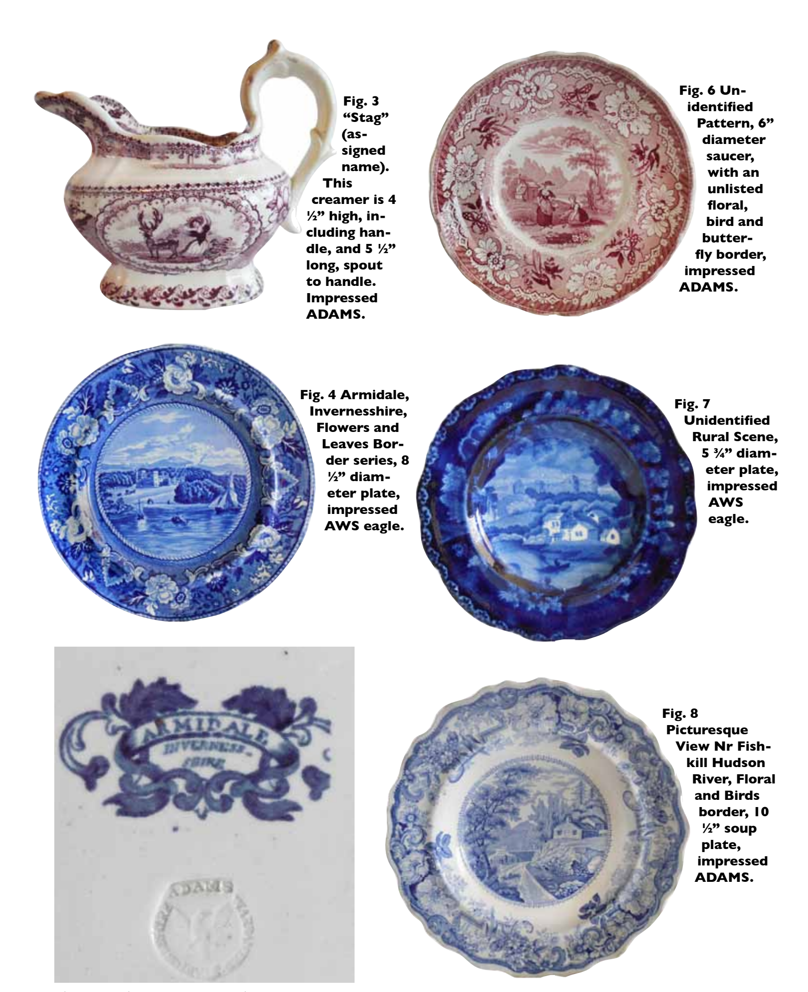
Fig. 5 Armidale, Invernesshire backstamp.