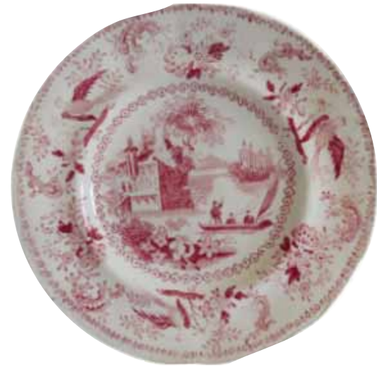
Fig. 12 Unidentified pink 3 7/8" diameter cup plate, with unlisted floral and bird border, impressed ADAMS.