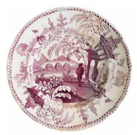
Fig. 18 Unidentified purple 4" diameter cup plate, impressed ADAMS.