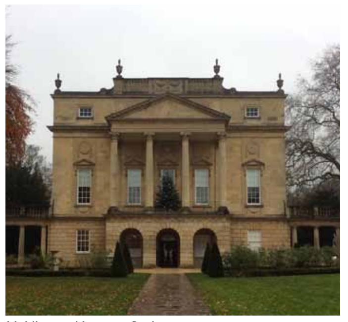
Holdburne Museum, Bath.