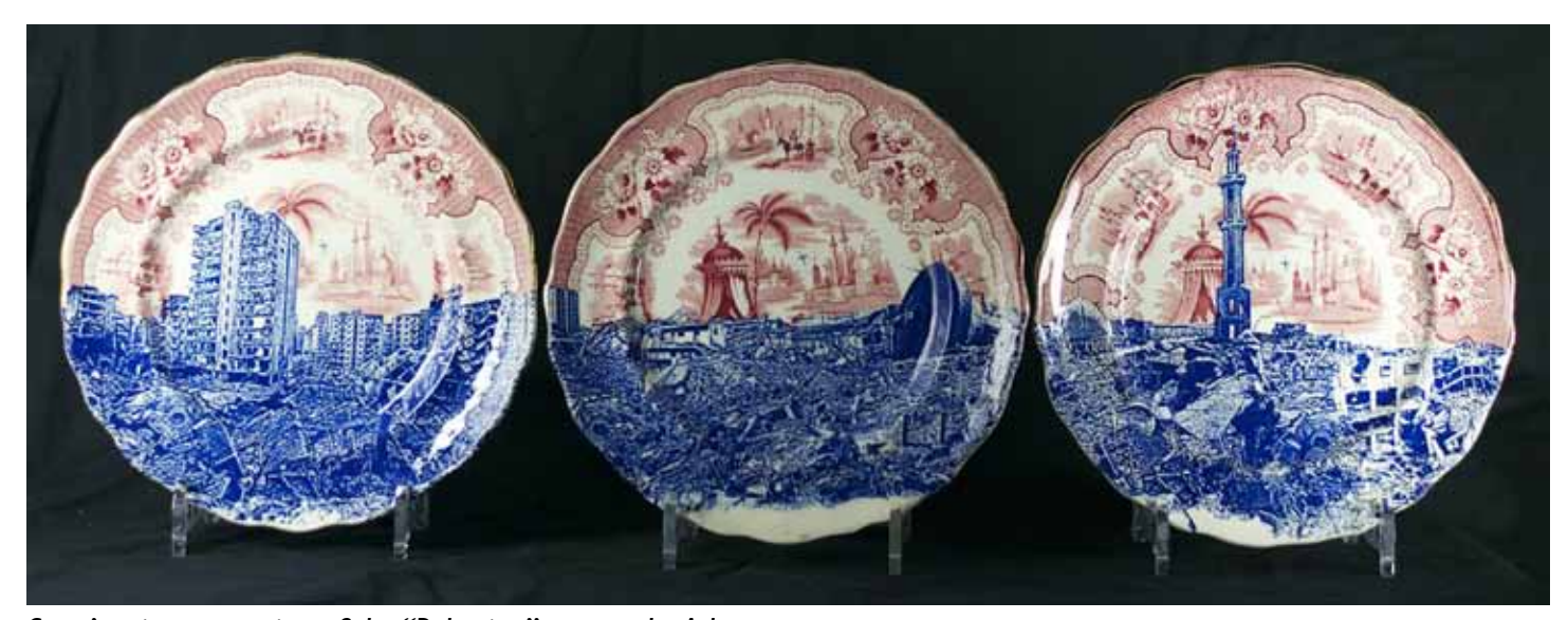
Scott's reinterpretation of the "Palestine" pattern by Adams