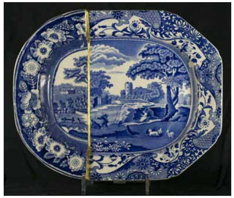
The "Wild Italian" platter.