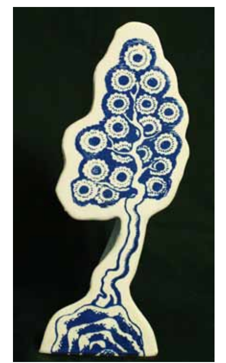
Free-standing ceramic trees, similar to those found in popular transferware patterns.