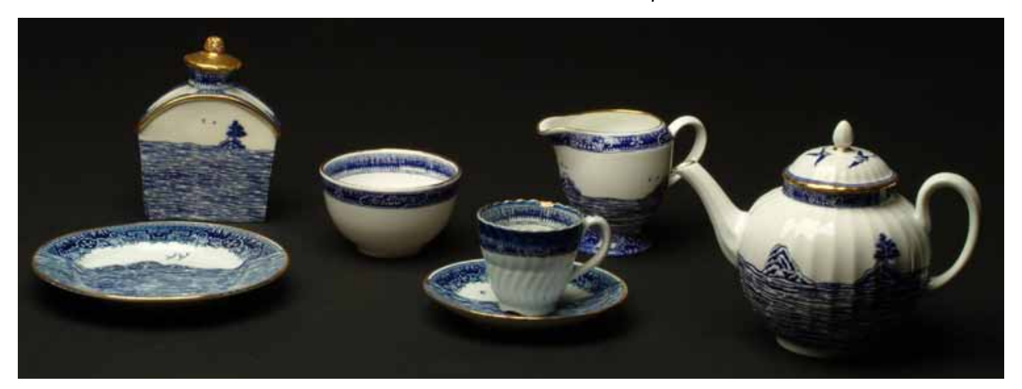
Tea set recalling the Chinese cockle pickers washed away in 2004.