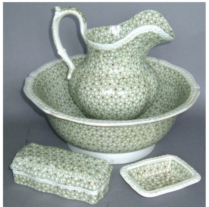
‘Quilted’ pattern Water or Toilet Set.

As the two adjacent potteries were operating in direct competition to one another, a successful Cambrian pattern or shape would be copied by the Glamorgan and perhaps vice-versa, whichever article was more commercially saleable at the time. Further work is being investigated and catalogued on this cross-over period of production between the two potteries.