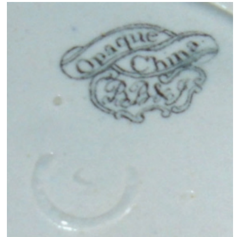
Impressed horseshoe and printed Opaque China marks found on Glamorgan Pottery wares.