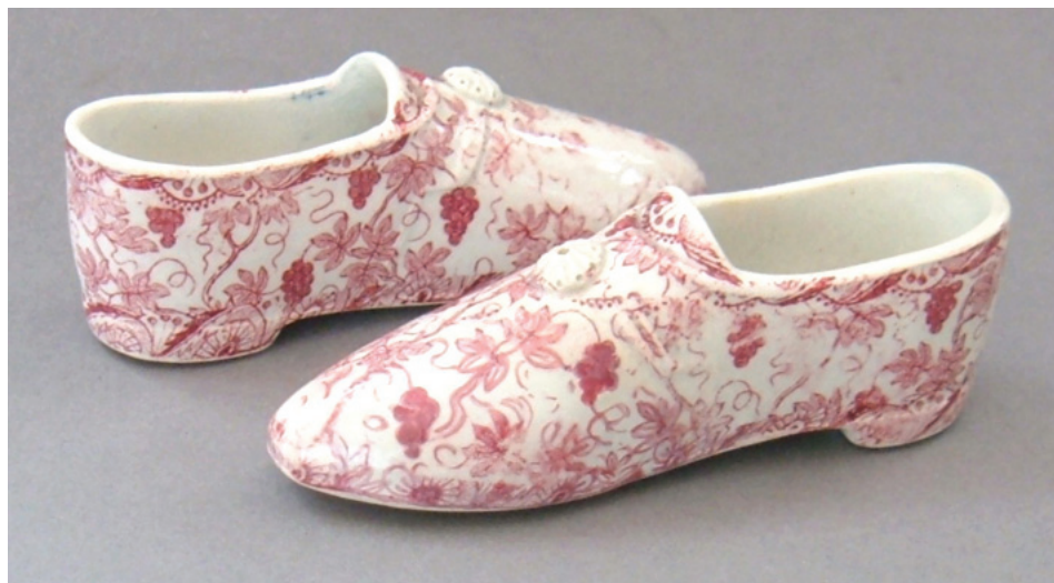
“Vine Pattern” slippers. Note the “M.R.” on the sole, a personalized gift, most likely.