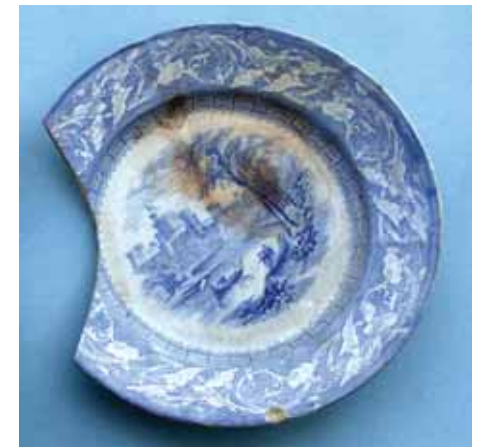
A broken 9 ½ inch broken blue plate in the “Windsor” pattern, by Mellor Venables & Co., Hole House, Nile Street, Burslem (1834-1851). The British Registry Mark on this piece reads August, 1849.

spring 1998 dig in Greenwood, five miles from Georgetown, diggers found a piece appearing to be from a child’s tureen and a child’s cup, both in the blue “Willow” pattern. These shards nudge our questioning minds. Why was a child here? Was she learning to set a proper table? Although a child’s tea party with her dolls is difficult to imagine in this intriguing, rough-and-tumble part of the