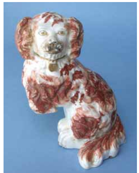
In a 2004 historical-bottle dig in Georgetown, California, this 9.5 inch broken, muddied Staffordshire spaniel, without his mate, was found guarding a broken 9.5 inch blue “Windsor” plate by Mellor Venables & Company, Burslem (1834-1851), and five pieces of a mulberry “Rhone Scenery” dinner plate by T.J. & J. Mayer, Burslem and Longport (1842-1855).

As if to again nudge the curiosity of this couple of transferware fans, in the spring of 1998, three flow-blue shards, bearing no identifying marks, appeared at our door. At the very next bottle-club meeting, we asked the active diggers from our bottle club, the