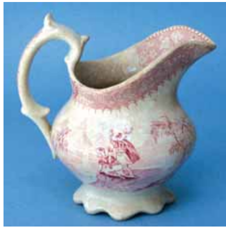
This 5.5 inch pink jug was dug in Old Sacramento, probably about 1970, in the “Peruvian Hunters” pattern by Goodwins & Ellis, Flint Street, Lane End, Longton (c. 1840).

Obviously, adults were not the only residents of the gold-seeking settlements. Small folks also inhabited the villages that dotted the gold-laden foothills. From a