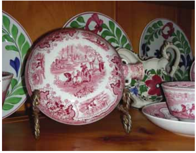
Rare Palestine Flask from the Buch Collection.