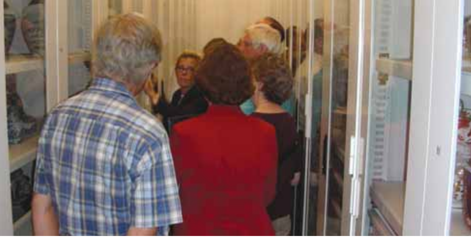
TCC Members exploring the ceramics storage area at the Philadelphia Museum.