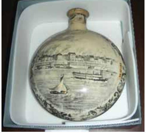
American Historical Flask (Pittsburgh w/ Steamboats Home, Lark & Nile) from the collection of the Philadelphia Museum.