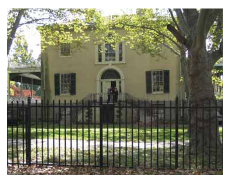
Lemon Hill as seen today and on the Stubbs Platter "Fair Mount Near Philadelphia".