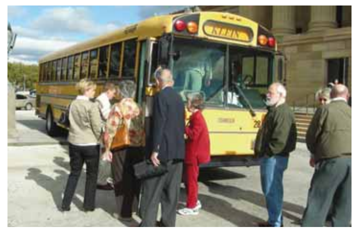
TCC Members boarding the bus at the Philadelphia Art Museum.