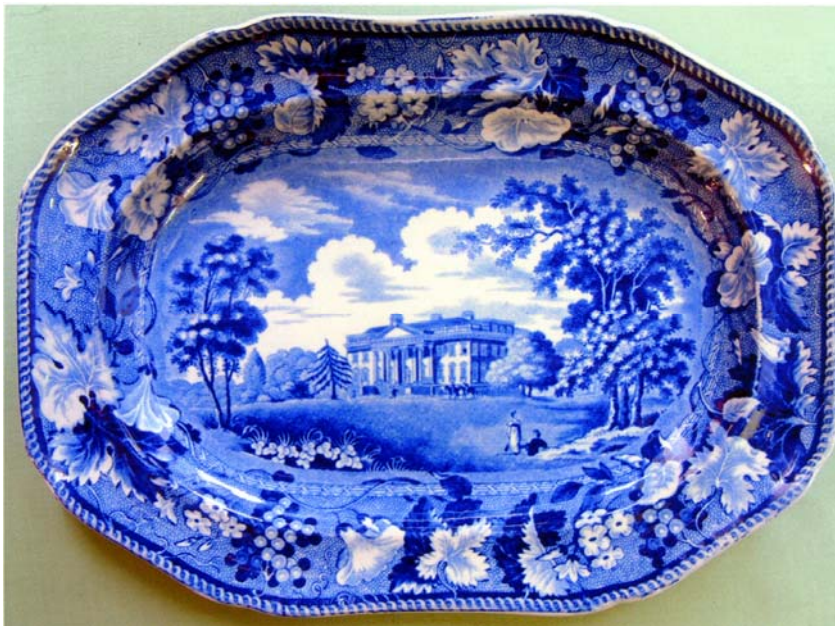
Above is the Enoch Wood & Sons Grapevine Border Claremont House platter, 10 5/8" x 7 7/8" see p. 8. Flower cartouche and impressed eagle mark for Enoch Wood & Sons, Burslem.

The two images to the right, show the newly discovered mug with "Mount Bellew, Galway, Ireland" part of Wood's Grapevine Border series, see p. 10.