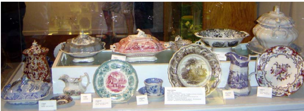
The images left and below are from Sam Kisse. They show some of his transferware on exhibit at the Chico Museum in Chico, California. This is part of an exhibit "Chico Collects" which runs through January 8, 2006 at the Museum.