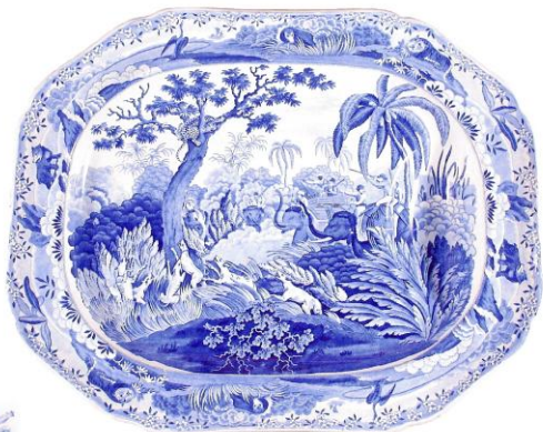
7-10 Well & tree platter 21 1/4" x 16 1/2" Unknown maker's "Oriental Sports" series Shooting a Leopard

For the first time, every known scene of India on transferware is included in one book, together with photos of both the patterns and the source prints from which they were derived. Each pattern and its source prints (sometimes as many as five) are shown side by side so that they can easily be compared. The text, with a foreword by Dick Henrywood, discusses the ceramics and their manufacture, the artists who created the prints, and the books in which the prints were published. This soft cover book, in full color, has 234 pages in an easy-to-hold 9 x 7 inch landscape format. Two typical two-page spreads are shown below.