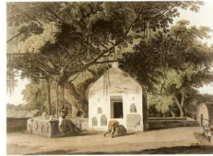
The Sacred Tree of the Hindoos at Gyah, Bahar