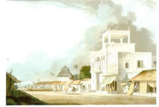
View on the Chitpore Road, Calcutta